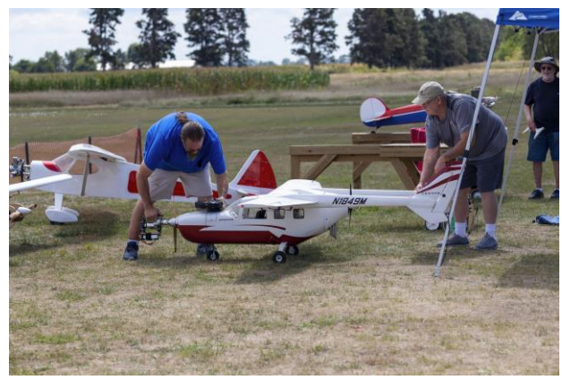
Cont. page 14