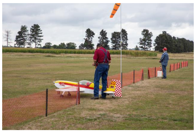
Cont. page 11