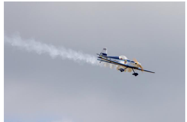
Cont. page 13