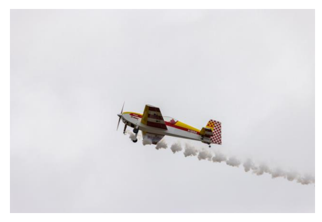
Cont. page 8