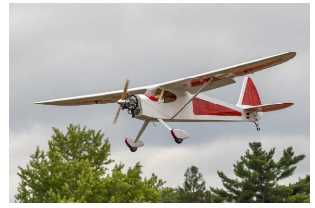
Cont. page 9