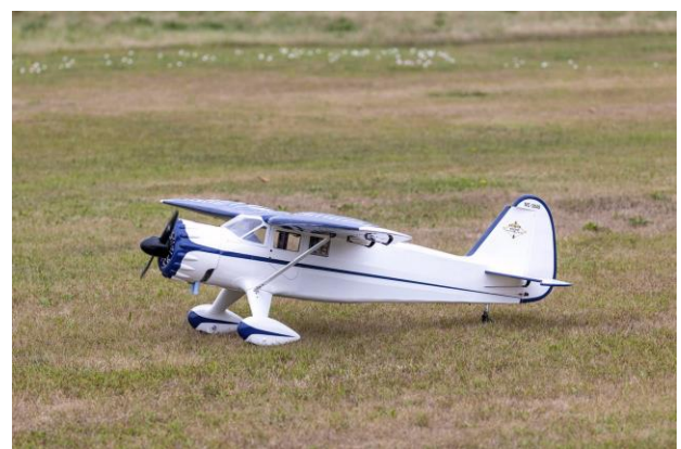
Cont. page 12