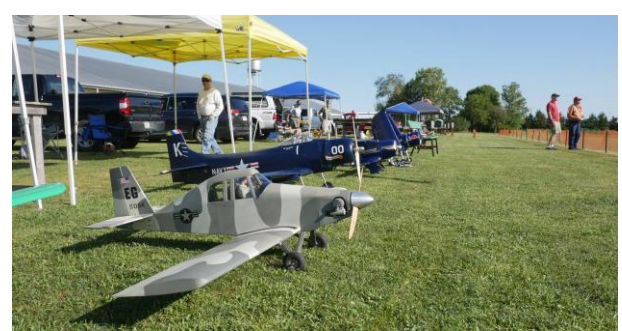
Cont. page 6