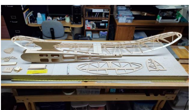
Rubber bands will hold the wing to the pylon.