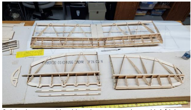
Quick wing assembly with main center section and left/right outer panels.

All the parts for the Bogie are laser cut and interlock for a precise build. Unique to it is that you assemble everything before gluing. Parts lock together like pieces of a puzzle. Because this kit was so well designed; I was able to start and finish the fuselage in less than an hour. The instructions called for the fuse to be first assembled, then followed by thin CA glue. Next month, the final step of covering as well as installing radio and power.