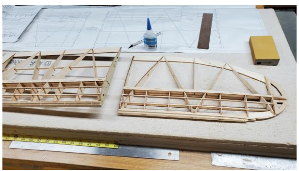
Using a polyhedral brace, two dowels, and four rare earth magnets; the outer panels are removeable for easy transport.