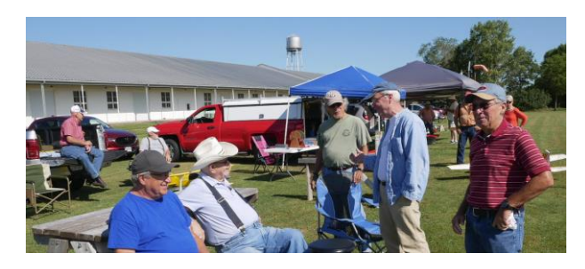
Cont. page 7