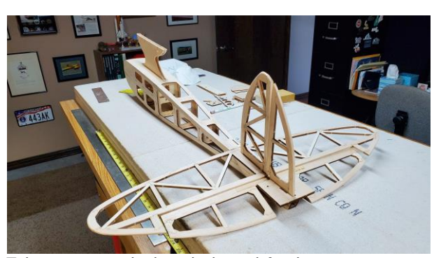
Taken on a nice look with the tail feathers.