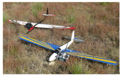
Sorry I don't know the names of the slope gliders very well, I will just put a few images on this page and caption them if I can. Blue wing plane is a DAW126 from Magnum Models.

The SSE winds were right up the main slope for the two days I was there, Friday and Saturday. It sounded like the guys who were there all week got plenty of flying on the main slope. The winds varied enough that we were able to fly the lighter planes in the morning and bigger faster planes later in the day. About 10 to 20 pilots were in attendance for this fall fun fly. Included are my photos.