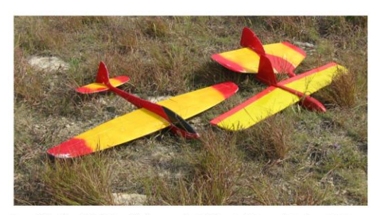
Dream-flight Ahi on the left, Weasel in the rear and a Moth from North Country in Southern CA. EEP