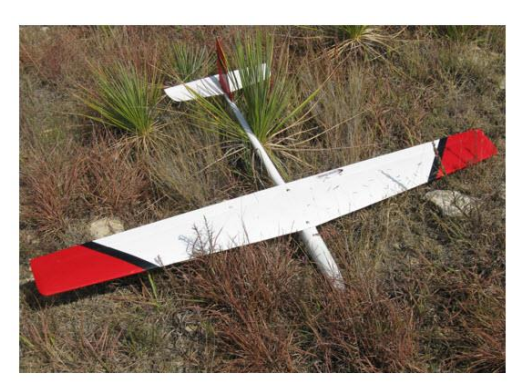
"Bad Voodoo" one design racer (ODR) from Magnum Models.