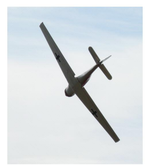
FW190 "Warbird" racer