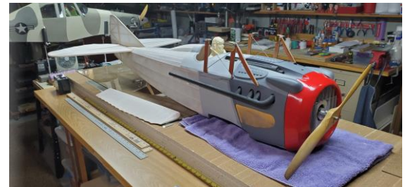
Flat gray primer on sheeting.