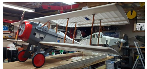
Airframe with two coats of polycrylic.