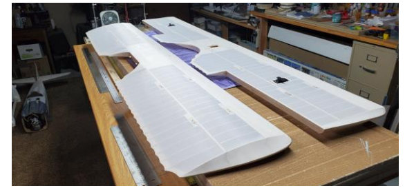
Koverall tacks down great with the Stix It.