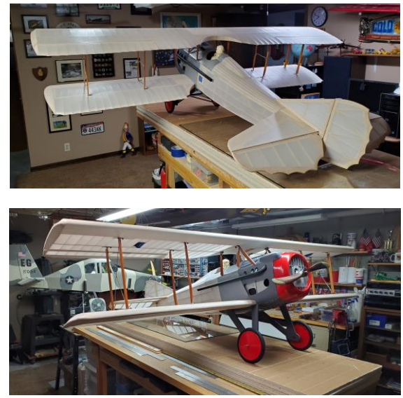
The original full size SPAD did not have any dihedral, and neither does the Balsa USA model.

Radio is installed, and so is the DLE 35RA . So, there will just be incidental work after painting to get it ready for the first flight.