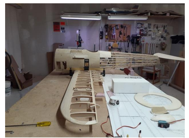
Incidence meter on bottom wing showing +2 degrees. Tail at +3 degrees.

I'm using torque tubes for the ailerons, which is another first for me. These are carbon fiber arrow shafts and will provide plenty of rigidity for these control surfaces. Up close are the tube attachments I made from brass to unplug the wings from the center section. They're a little heavy, but not too worried about the weight of this almost 10' wingspan airplane. Soldering the top wing mounts went well, all points considered. BALSA USA shows how to make a jig to locate everything properly for alignment purposes. I changed their method a little to include flying wire brackets to improve the scale look. These are also handmade from brass sheet. I'll glue the tubes into the ailerons next and then be ready to start covering the wings. I'm using SIG Koverall with dope primer and a yet undecided type of paint. I'm leaning towards latex, but have never used it before so I may need a few pointers from those of you who paint with it.