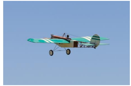
Cont. page 6