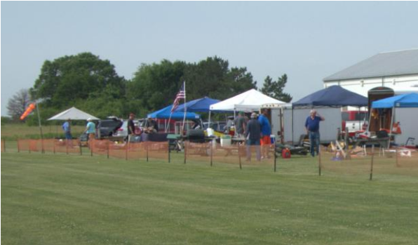
Most attending brought their pop-up shades for relief from the sun.