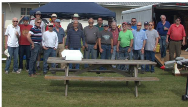
Only way we were able to gather everyone for a group picture was by baiting them with the full box of donuts on the table.

Thanks to all of you who attended. Good time was had by all.