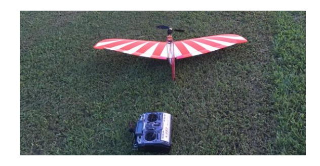
All the best, Chen

I bent piano wires for 3 degrees of dihedral each, totally 6 degrees, enabling to join the two wing halves firmly for flying. And I could split them away, then put them and the fuselage pod with fin into a box. By this way it's easy and safe for me to carry when driving my scooter.