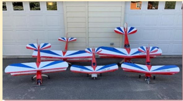
Front l-r Hog Bipe, Great Lakes Bipe, Sig Sky Bolt. Rear 4 Star 60 Bipe, and Bob Dively Skybolt.