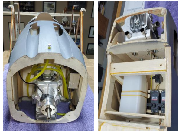
Note three fuel lines: carb, fill, and vent. Tank is 24 oz. Rudder and elevator servos are physically large "¼ scale" HiTec servos I happened to have laying around.