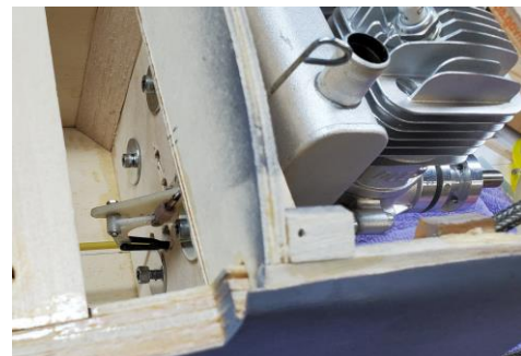
Engine choke on carb is push-pull to the rear through firewall. I used a 90-degree bell crank connection to operate it through fuse bottom with looped wire.