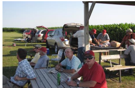
Tuesday evenings was always a good draw for members. Especially when food was grilled and served.