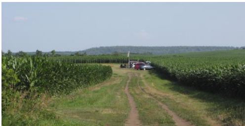
The road in. Viewed south.

These photos are of Springfield circa 2008. Note how we were surrounded by not just any corn, but GIANT corn. We lost several members going into that corn looking for their downed airplane. Never to be seen again. Although we have great memories of Springfield, we have a much better field where we are now.