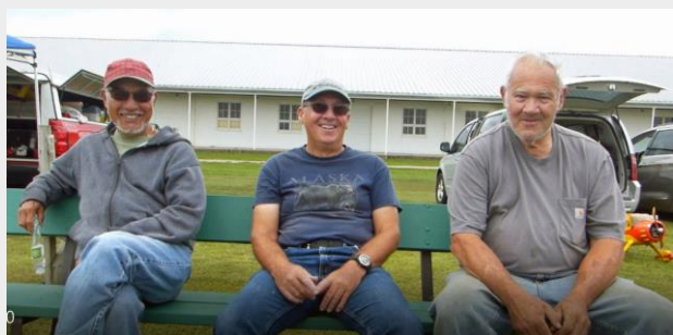
TAKING IN THE BUD HALL LARGE SCALE FUN FLY 2019