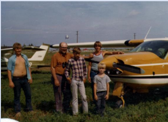
Farm Family Circa 1972 Mead ARDC Airfield

Back in the day (50 years ago) Nebraska farmers would fly their airplanes to the ARDC airfield and attend seminars. They also flew in for equipment auctions which were held on a three-year rotation on our flying field. Note the water tower in photo as a reference point. Our WRCF field is behind young man on left. See aerial photo below showing location of both fields. The airfield was plowed under many years ago and is no more.