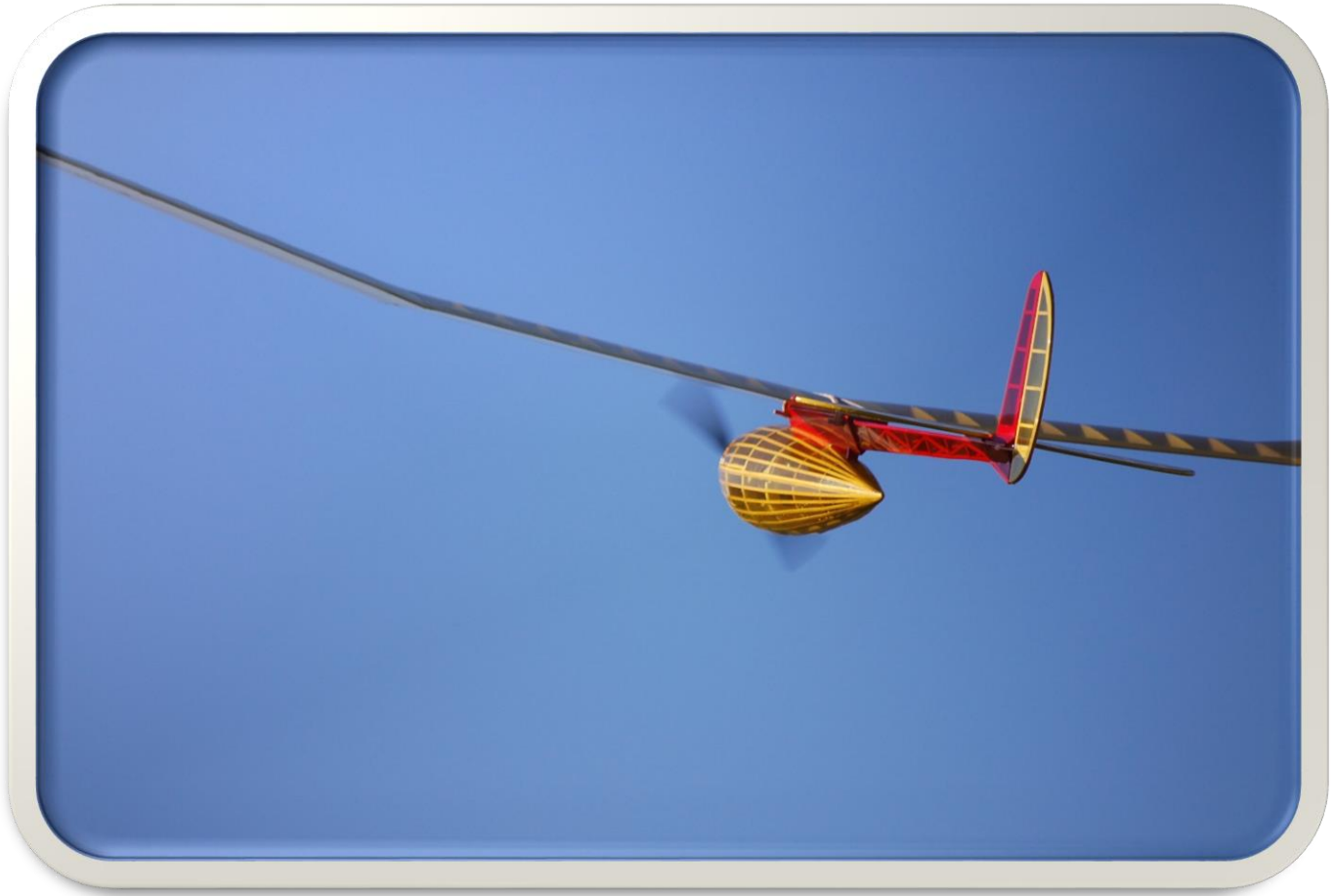
Airstream streaks skyward