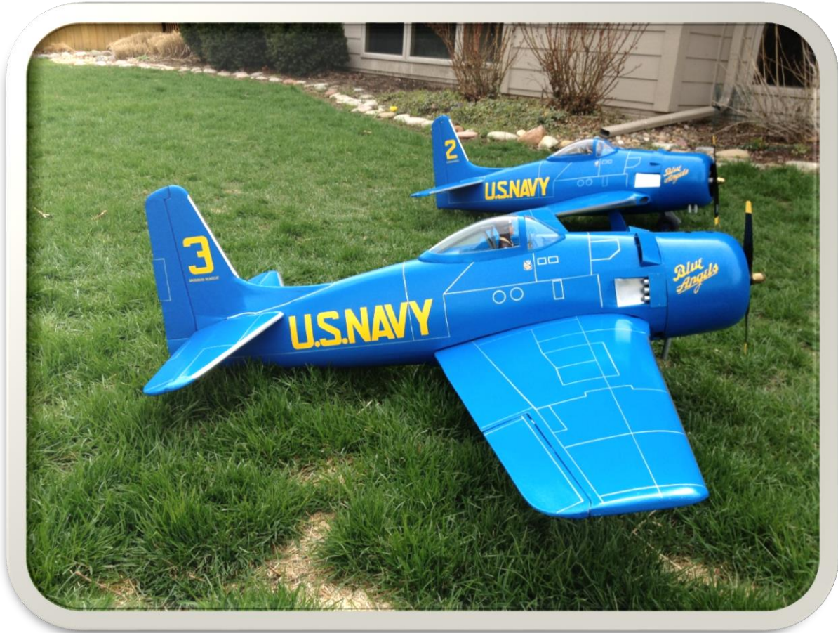
Bernie Bearcat is in the background Tail Number #2