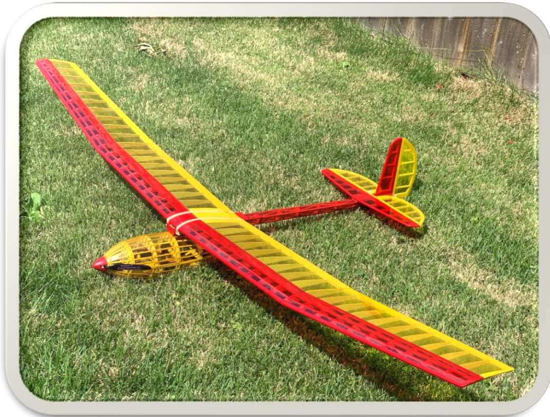
The plane is called the Airstream

The flying site is Perranporth, UK on the north coast of Cornwall.