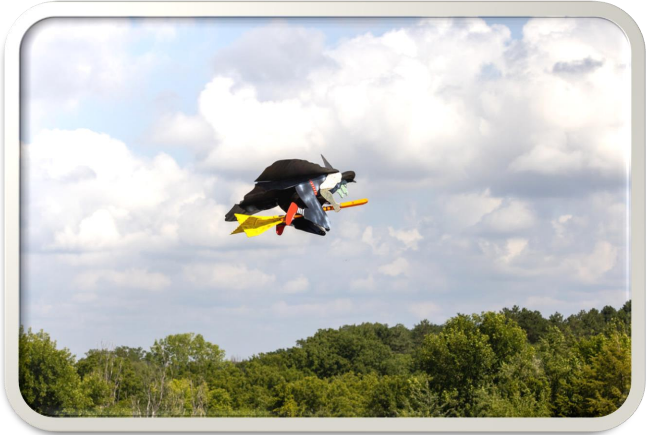
The witch flying at Labor Day 2022 Air Show