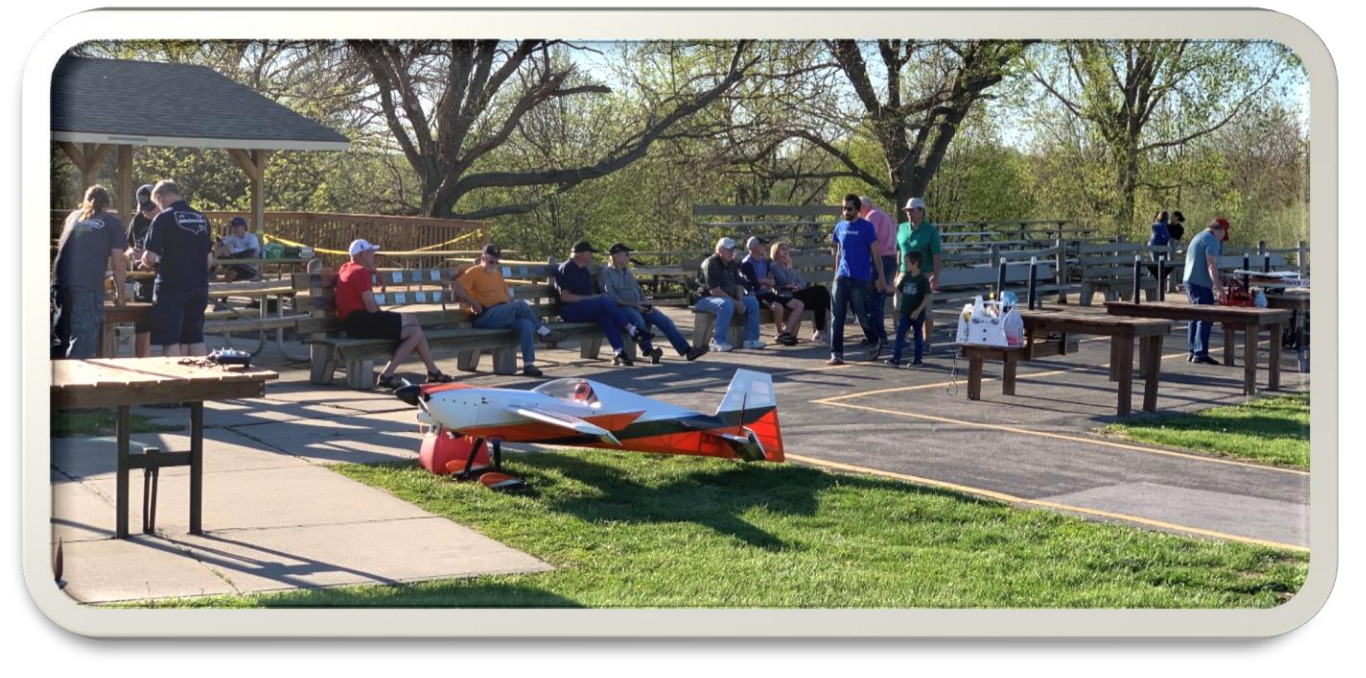
Training Nights (Thursday 6 PM to 8 PM) are very popular