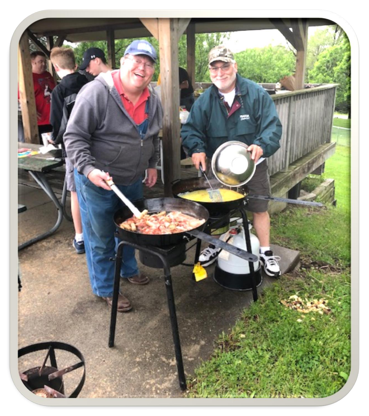
Doc and Bob W serving up eats at the 2019 "Egg Burn"

Note: Please make reservations on line at omahawks.org or call Rick Sessions at 402-312-6482 so we know how much food to prepare.