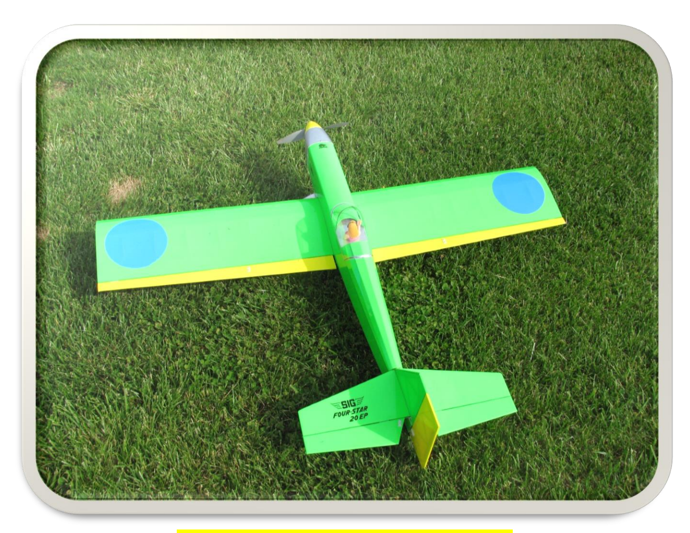
This is the 4 Star 20 owned by Loren B