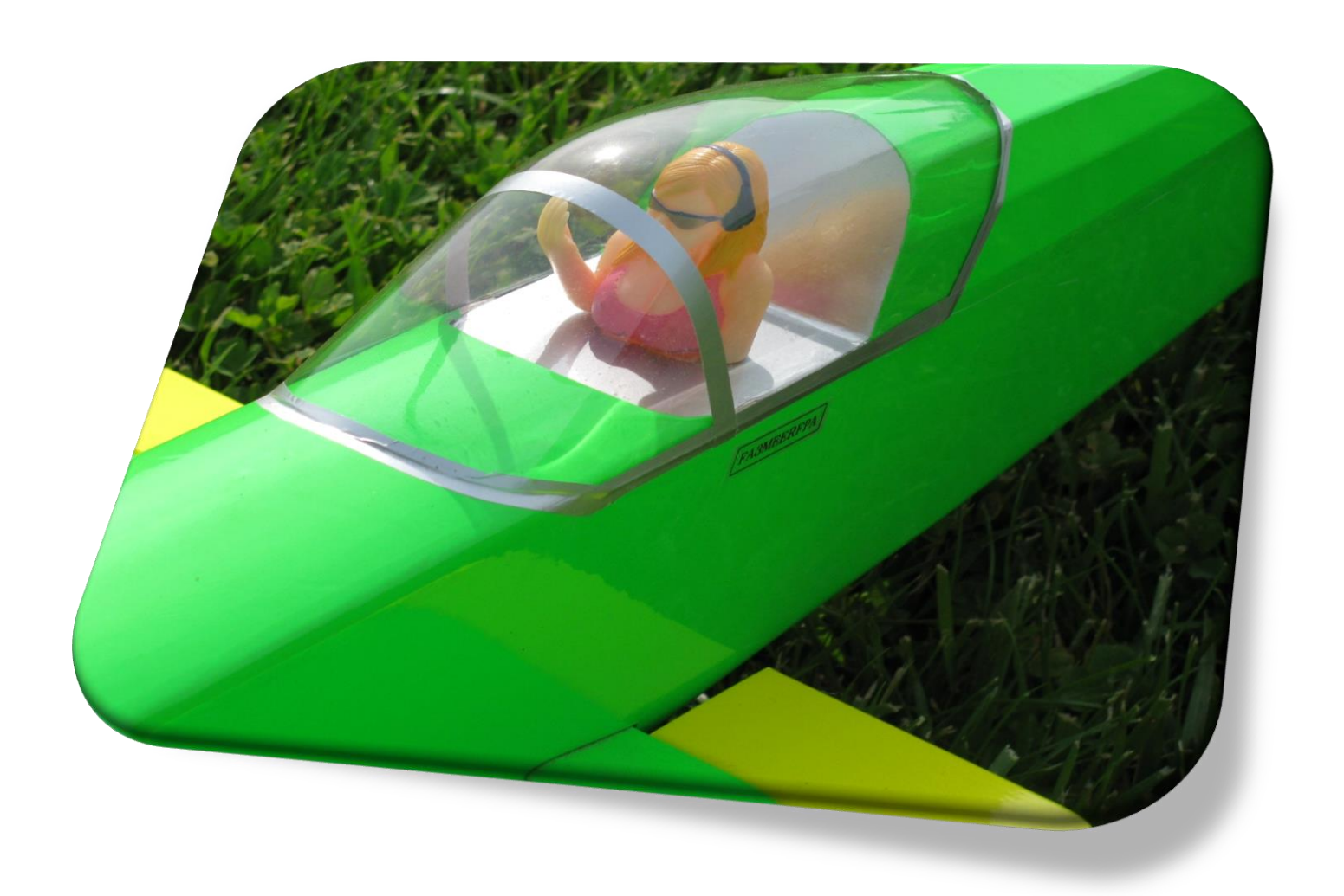
Interesting closeup of Loren' 4-star 20 pilot