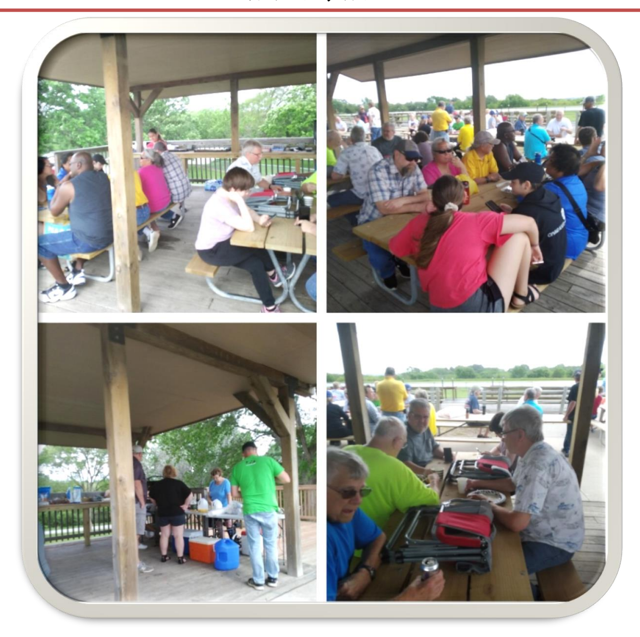
Our members all had their fill in the end