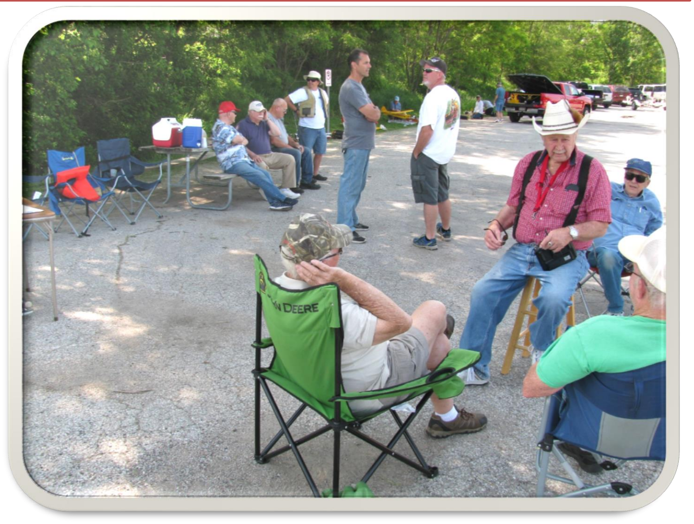
Pilots and spectators, sharing some tall tales I am sure!