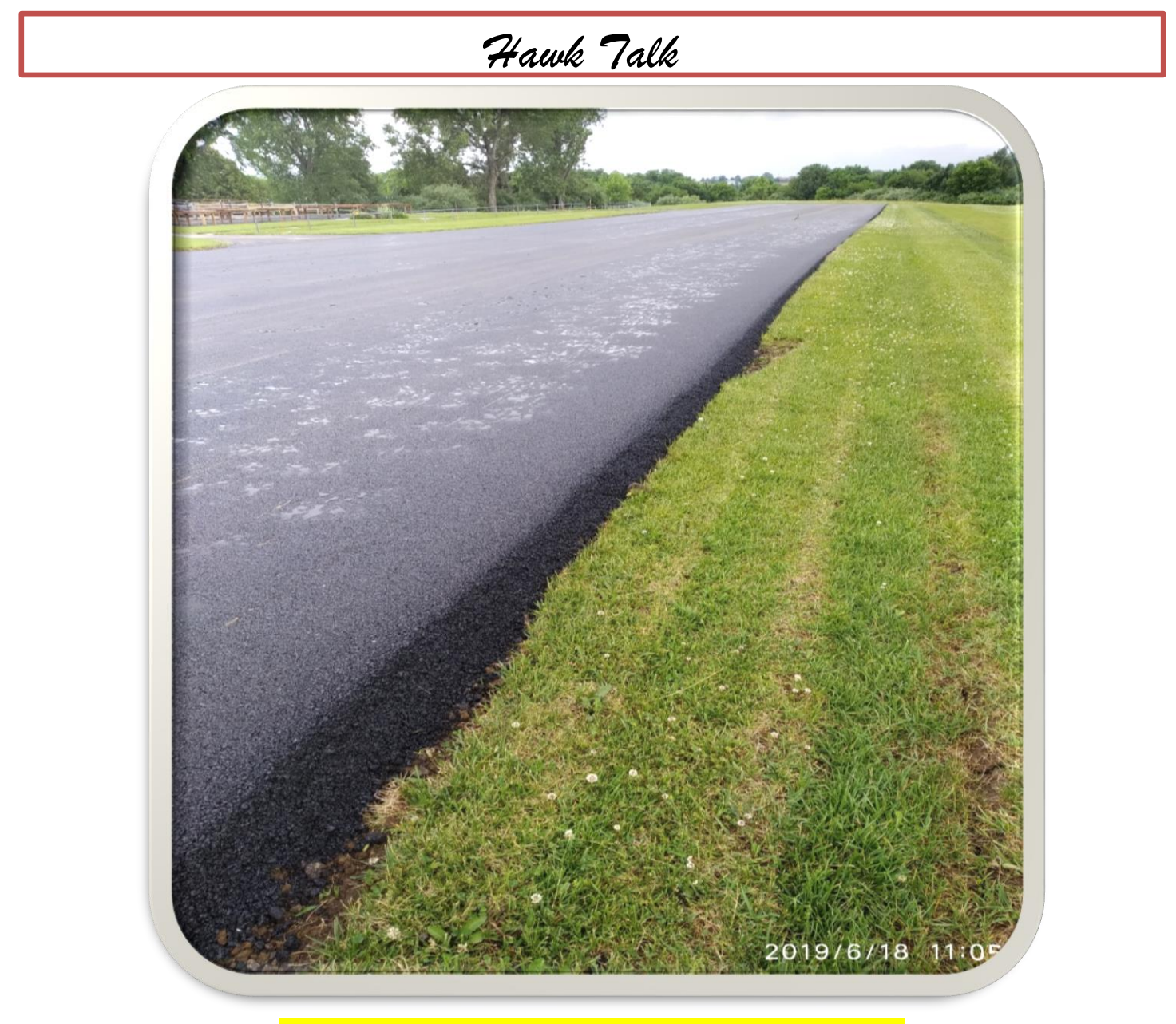
The finished product, awaiting final painting