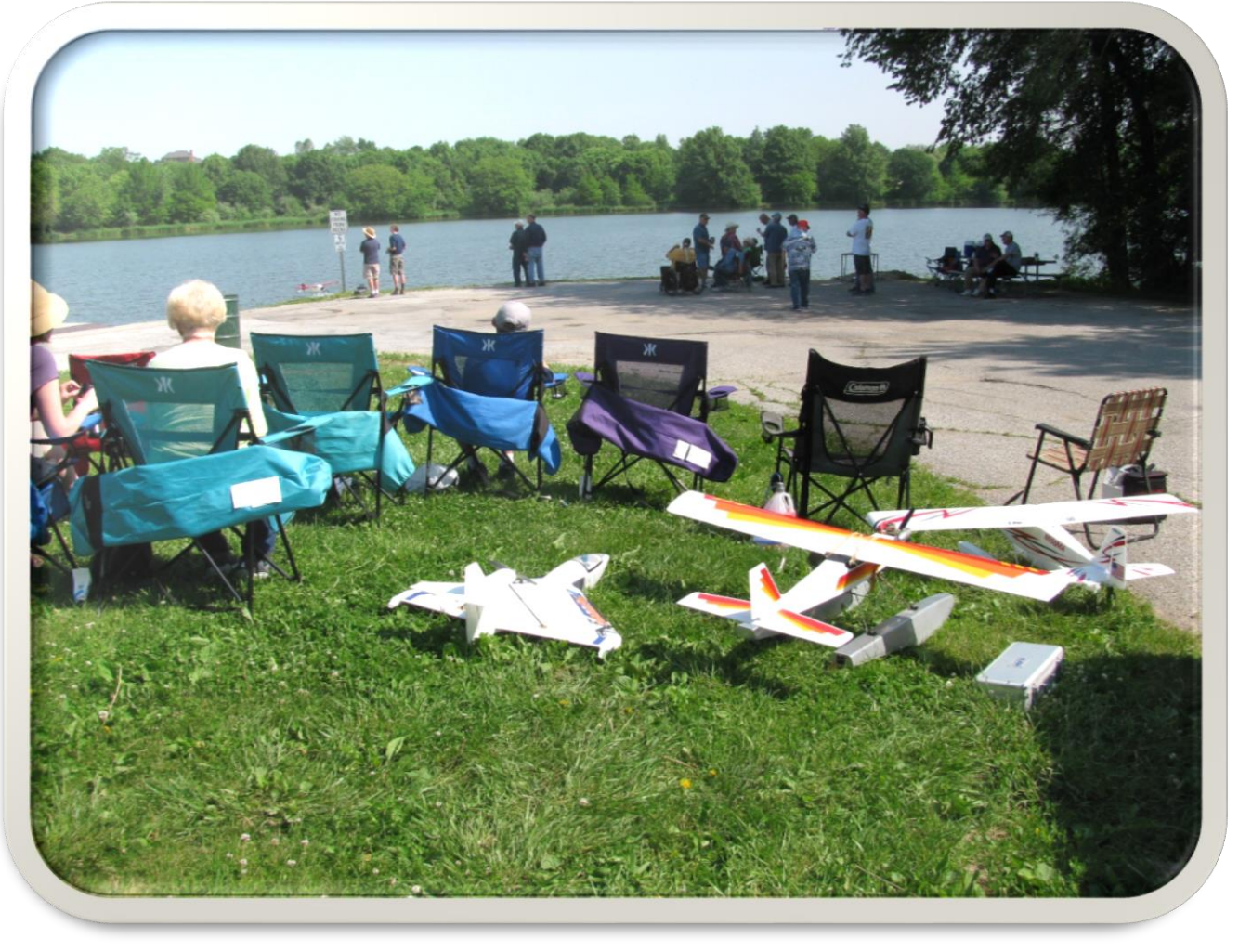
View of Standing Bear Lake during Float Fly