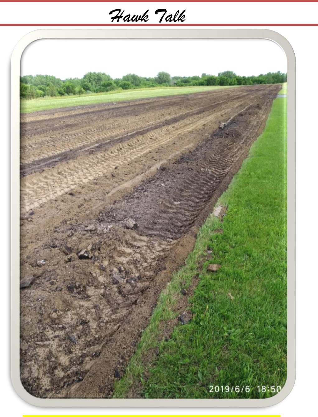
Old runway surface is removed down to earth!