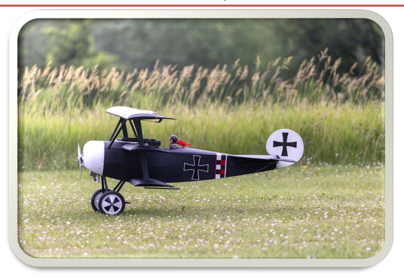
California Ron's WW1 plane on takeoff roll