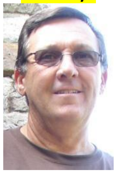
RIP Dear Friend!!