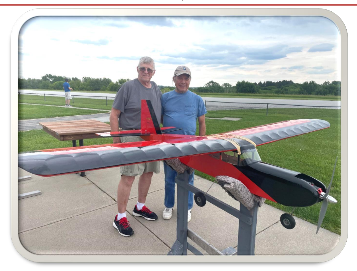
Our two Builders of the Red Trainer pictured with completed Sig Senior

As you can see, Big Red turned out great and flies on rails!