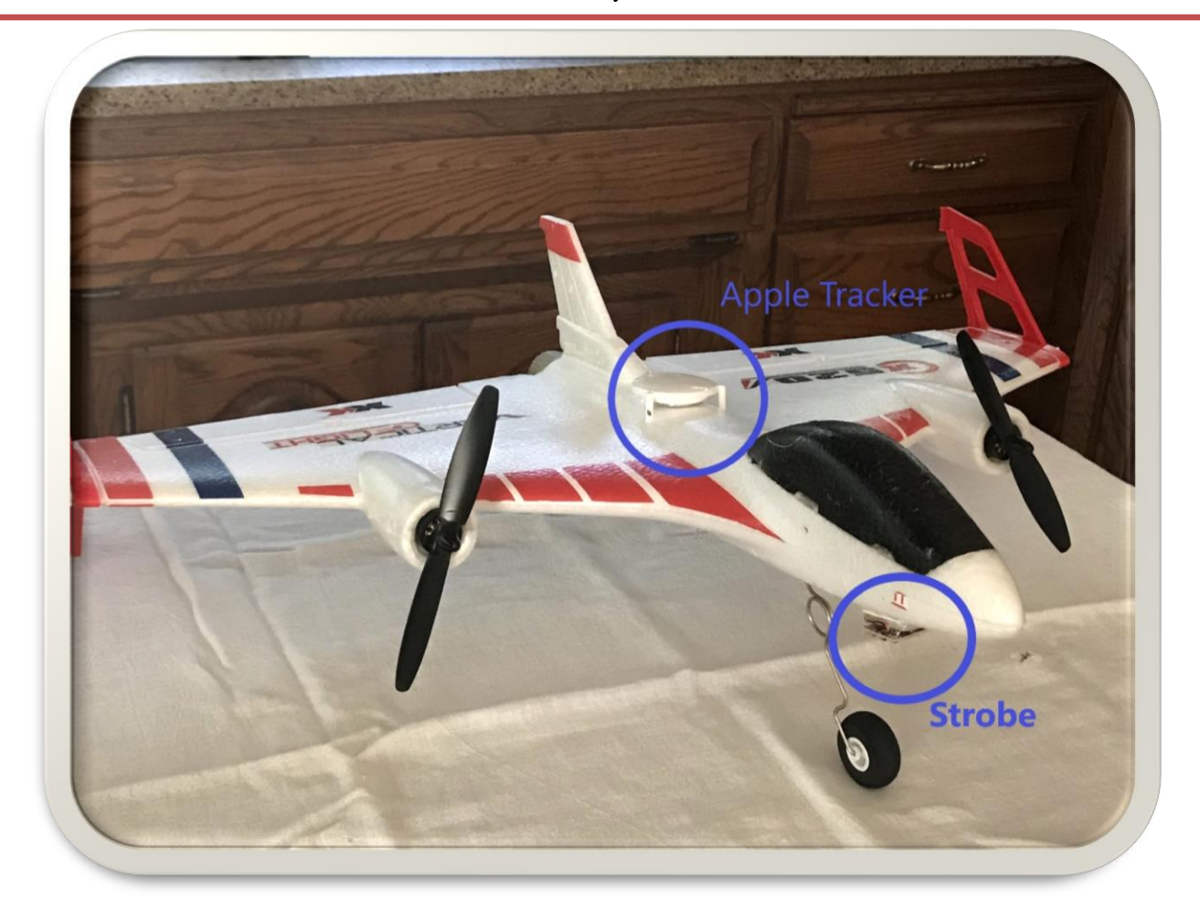
Note tracker locations here

I am hoping this will never need to be used—trees are still a hazard but at least you will know which one it went down in.