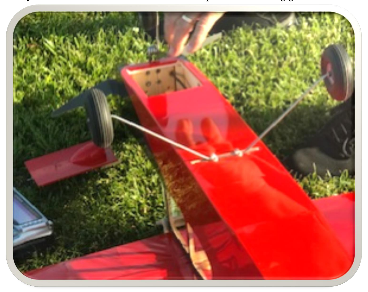
Closeup of Front Hatch Opened

Ron Pacana built and covered the fuselage. It was extended 2" to hold a 6-cell lipo battery this extra 2 inches of structure would help with establishing good balance.