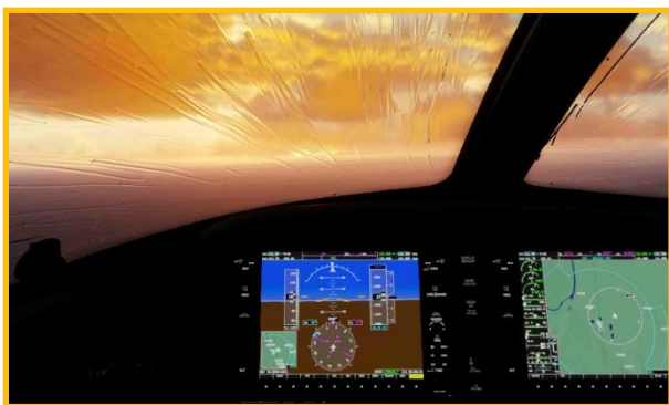
Full-Scale: The View

Having some experience flying full-scale gliders as well as many hours on simulators, I can say that many elements of flying are nearly identical. That being said, there are some really cool things that you can only do on RC airplanes, as well as some experiences you can only get on full-scale aircraft! In this article, I explain my favorites of each world. (Left - Flying at sunrise on the simulator)