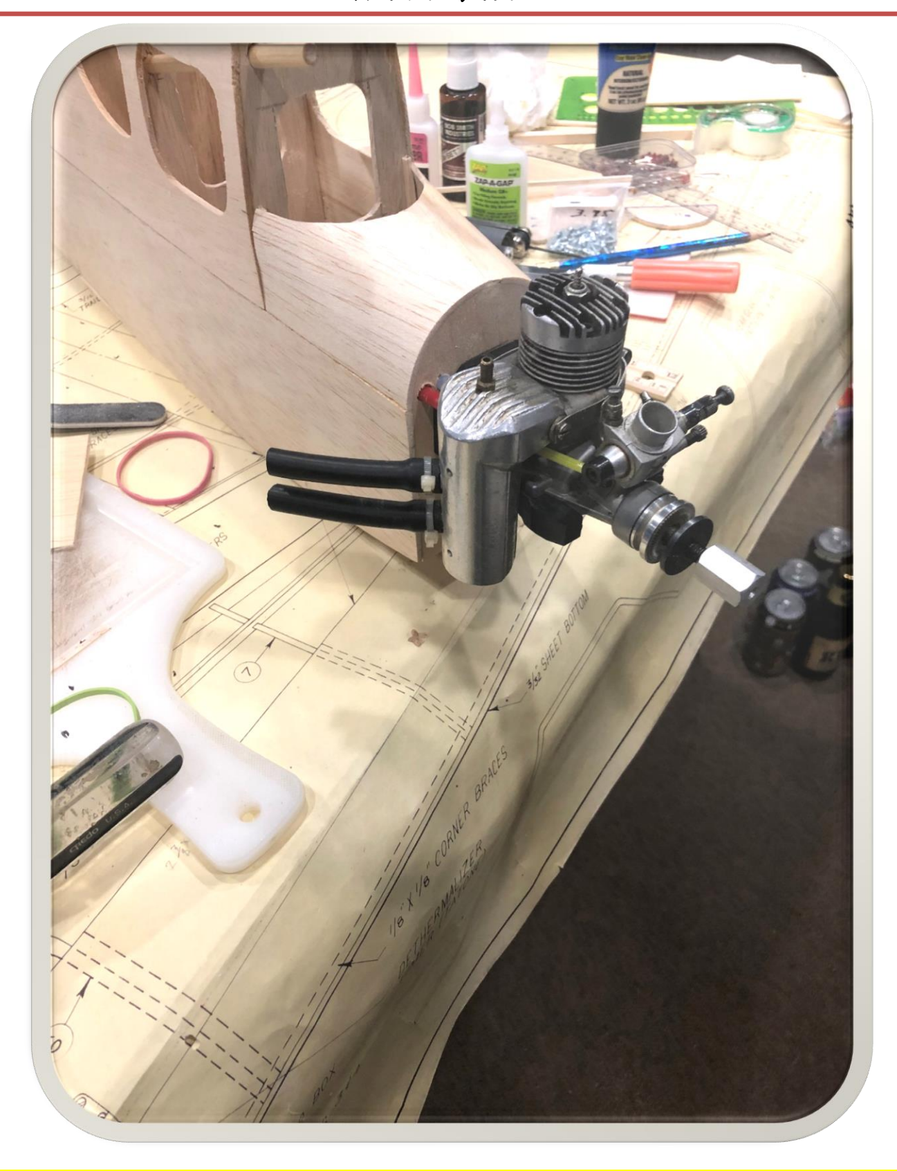
Another great picture of the engine installation details