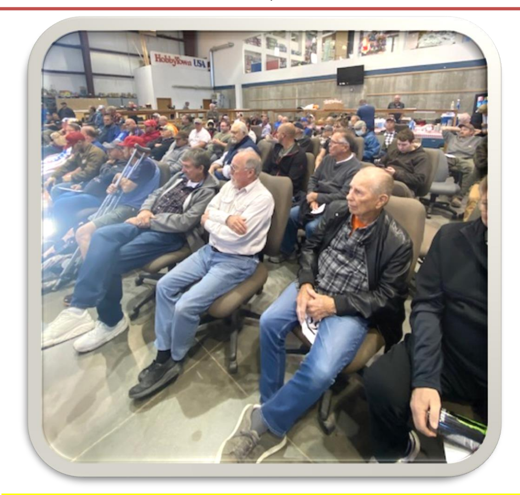
Auction Audience, I see some familiar faces!

After all registration income and expenses were included the final profit from the auction was just over $2100. Those dollars will help fund the upcoming events for the next year. Get your suggestions and recommendations to the board of directors concerning events and functions that the club members would enjoy. We should have some fun with that money after all the hard work.