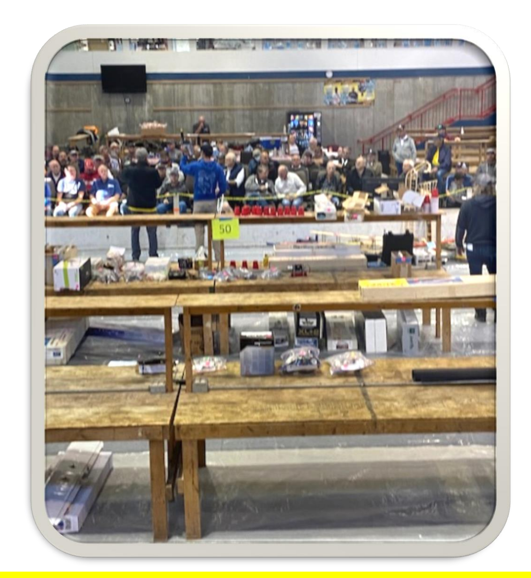
Good shot of the HobbyPlex room and Audience

The doors opened at 7:00 (or soon after) to get the final computer set up and get the concessions and registration tables loaded. Customer, mostly sellers were bringing their stuff in by 8:00 and the tables started to fill up.