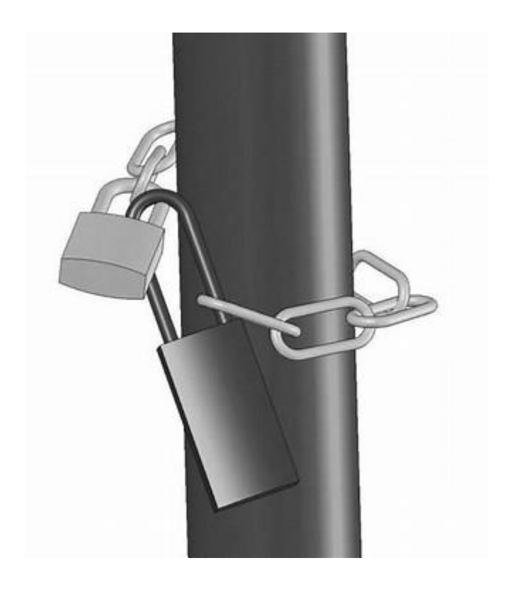
YouTube Daisey Chain process: <a href="https://www.youtube.com/watch?v=RNDi22UxIXY">https://www.youtube.com/watch?v=RNDi22UxIXY</a>

Please ensure the lock is secured in a Daisey Chain fashion as illustrated by the photo below and the You Tube Video as well! To ensure that when either lock is opened you may access the gate and gain access to the field!