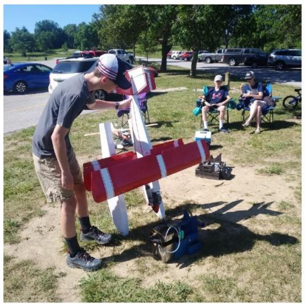
Loren Blinde Biplane on floats after it flipped over in the lake