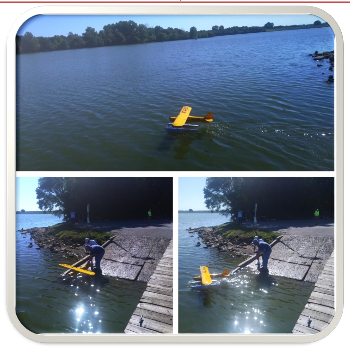
\label{eq:cub_problem} \mbox{Tom V' Cub, heading off for another Flight}