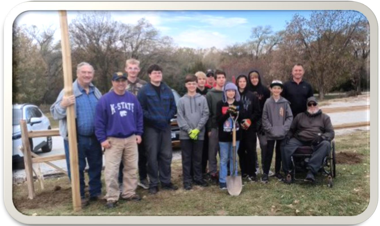
Project Crew Team Picture with completed Fence!

Thanks also to all the flying club members for allowing me to rebuild this fence for my Eagle Project.