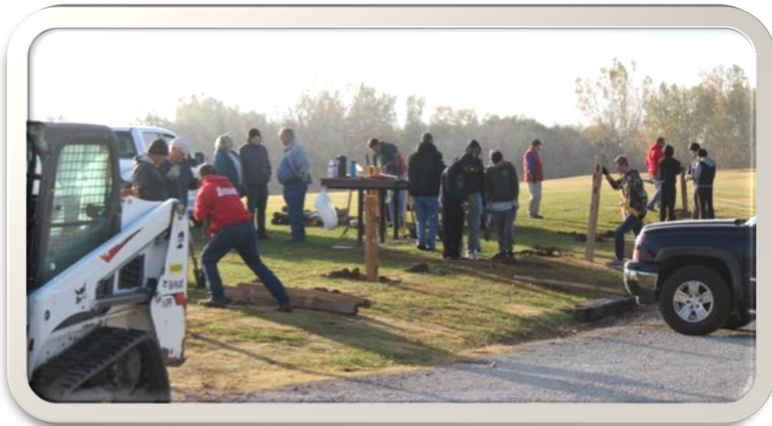
Crew sets the first new posts in!

We had plenty of people show up who were all very helpful.