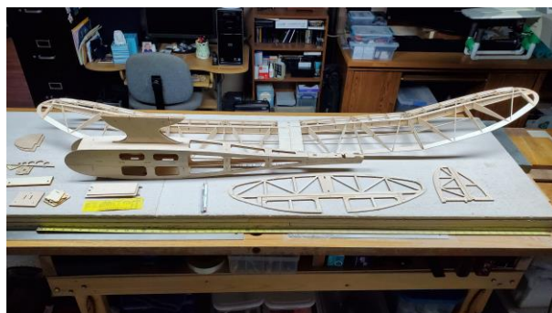
Rubber bands will hold the wing to the pylon.