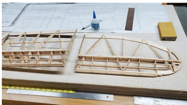
Using a polyhedral brace, two dowels, and four rare earth magnets; the outer panels are removeable for easy transport.