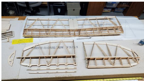
Quick wing assembly with main center section and left/right outer panels.

All the parts for the Bogie are laser cut and interlock for a precise build. Unique to it is that you assemble everything before gluing. Parts lock together like pieces of a puzzle. Because this kit was so well designed; I was able to start and finish the fuselage in less than an hour. The instructions called for the fuse to be first assembled, then followed by thin CA glue. Next month, the final step of covering as well as installing radio and power.