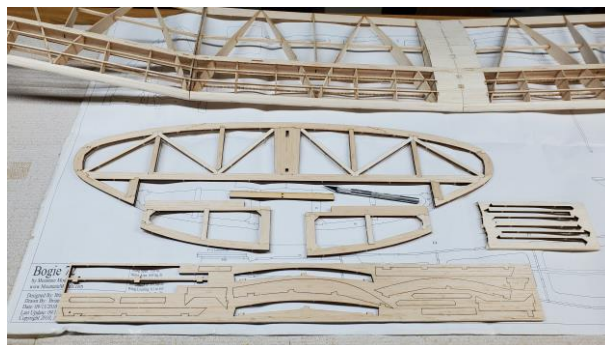
As seen, the laser cut parts were precise. As they interlocked, I didn't need to use the plan sheet under the parts.