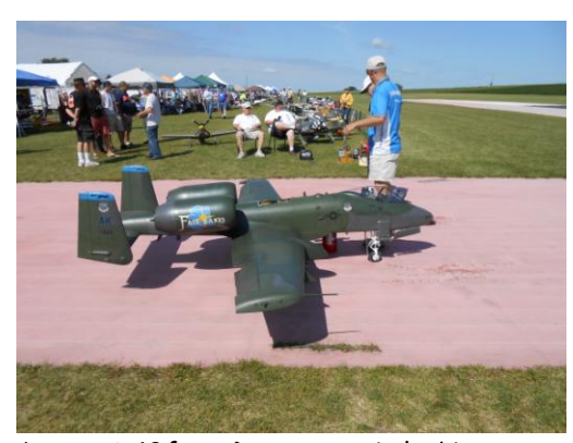
Large A-10 from Denver, again looking west.