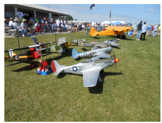
Some of the 300+ planes just East of center stage.