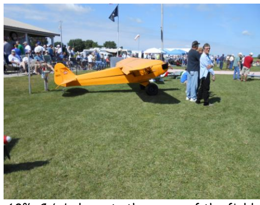
60% Cub, belongs to the owner of the field.