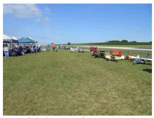
Flight line west of center stage.

northern MN. We all flew several times and had a great time.