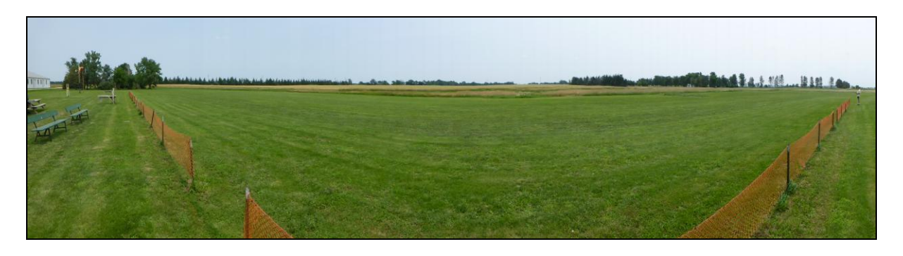
"The Wide Open Space of Mead Field"