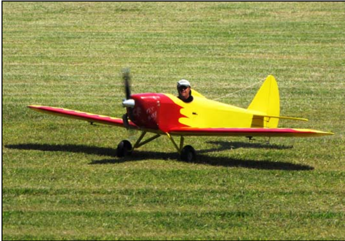
- Photo of Frank Wisniski sitting in his latest large scale IMAA aircraft. It is a Fly Baby that Frank spent last winter building. Wingspan approximately 84 inches with a 1.20 size four stroke used for power. Nice flying airplane!