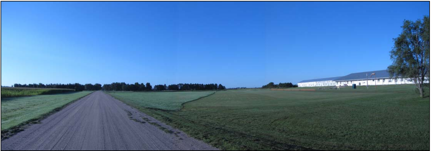
MEAD FIELD on a Saturday morning at 8:00am ready for the first flight of the day.