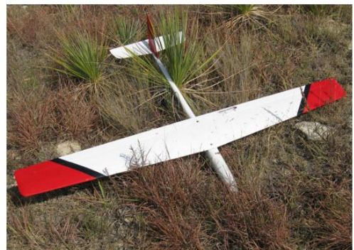
"Bad Voodoo" one design racer (ODR) from Magnum Models.