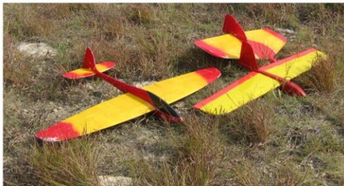
Dream-flight Ahi on the left, Weasel in the rear and a Moth from North Country in Southern CA. EEP foam slope gliders.