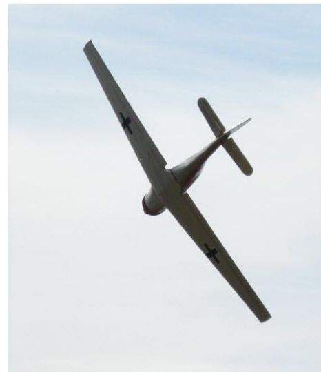
FW190 "Warbird" racer