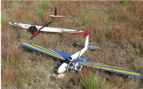
Sorry I don't know the names of the slope gliders very well, I will just put a few images on this page and caption them if I can. Blue wing plane is a DAW126 from Magnum Models.