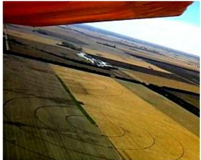
Several landing sites have been prepared in the area, when they are to be used is not known.

had to investigate further in spite of the imminent danger. I drove out to the area to verify that in fact the circles were almost undetectable from the ground, further evidence that they were not of human origin. Being careful not to drive right into the center of their hideout I looked unsuccessfully for the circles but soon realized they were drawing me in! The mental power they command is very powerful! Out there in the dark they were able to make every road and corner look totally unfamiliar, as if I were lost! Though sheer force of will I was able to outsmart them. I would turn down the smallest road that looked like nothing more than a goat trail knowing they thought I would take the easy road then I switched strategies and took the good road when they thought I was wise to them. When I was finally free of their power and able to regain my bearings, I was just outside of Bennington. The most frightening thing about all of this is what I discovered the next day. I checked the mileage on my car and found that it didn't add up to what it should have driving out to Mead and then to Bennington! These are dangerous and powerful aliens we are now forced to deal with.