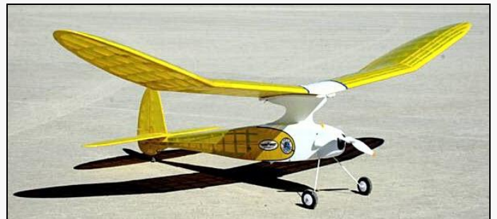
Old Timer Airplane

Location: Western R/C Flyers Mead Field 20 minutes west of Omaha, Ne.