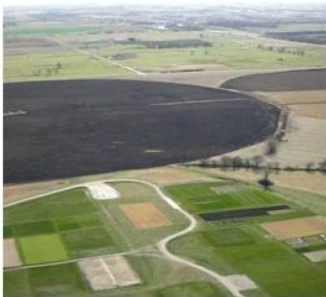
This alien landing site has been burned leaving no doubt that a landing has already occurred.