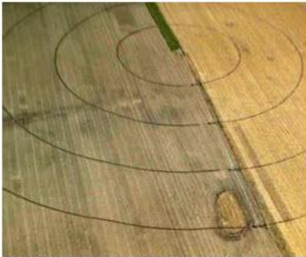
Picture taken from above. Mead field plainly shows what is most likely to be an alien landing site.

The enemy is already upon us and undoubtedly within our ranks! It is hard to say how many of our group have already been brain-drained by these invaders but it is a sure thing that they go for those in a position of power or leadership and also those that have certain skills such as designing and building airplanes. One of their greatest weapons is mind control! I am a witness to their mind controlling abilities myself. When I first obtained the video of the area around our Mead flying field the aliens must have known I would see the signs of their arrival but they were not yet ready to show themselves so they clouded my mind somehow so I would not see or recognize them. I only hope it's not too late!