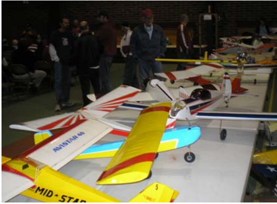
Photo Essay of Auction 2008 Cont....