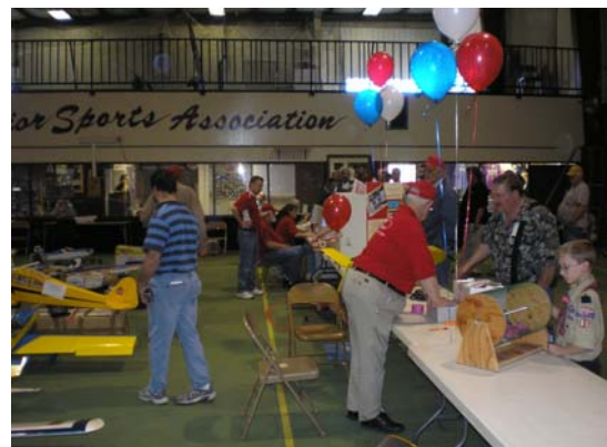
Photo Essay of Auction 2008

Remember to use Hobby Town's Reward Program . With every purchase by a WF member, the club receives a credit for an amount equal to 1 percent of your purchase. Be sure to mention your Western Flyers affiliation when making a purchase at either Hobby Town location.