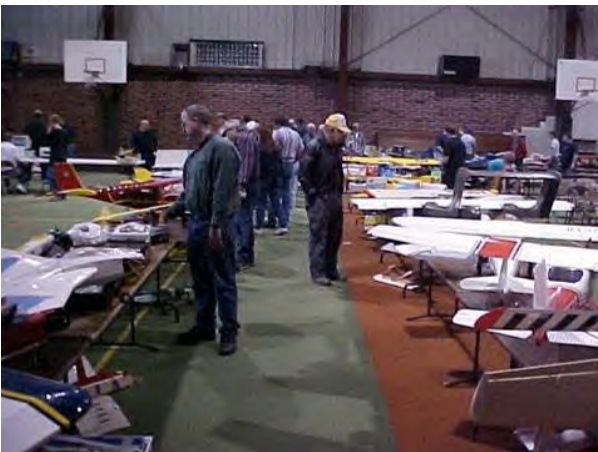
Our Annual R/C Auction April 24 th