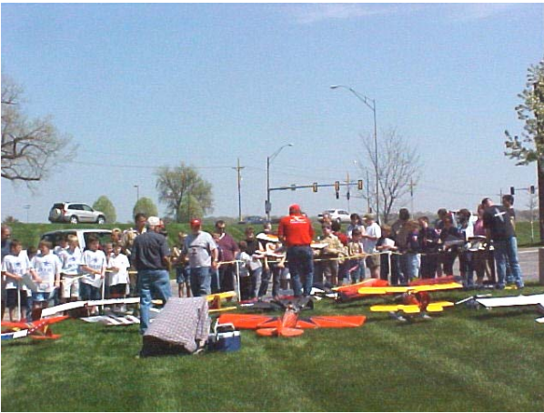
Scout Day April 17 th – Durham Scouting Center