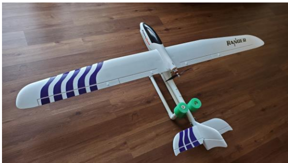
Photo is of my Volantex Ranger 2000 that will become my camera platform. As you see, it is an EP pusher that frees up the forward cockpit and fuselage area for cameras. I'm using a 30A ESC with 3S battery. Pushing it around is a Turnigy D2836/8 1100KV Brushless outrunner motor. Wingspan is 81 inches. Throttle, ailerons, flaps, elevator, and rudder for control. Wings and tail surface are foam and the fuse a "milk bottle-like" plastic that is durable.

We have one last "upkeep" project to do on our storage building this spring. Above the garage door a few sheets of plywood that are rotted need to be replaced. Then painted. If you can swing a hammer or use a brush, get in touch with Loren Blinde or myself.