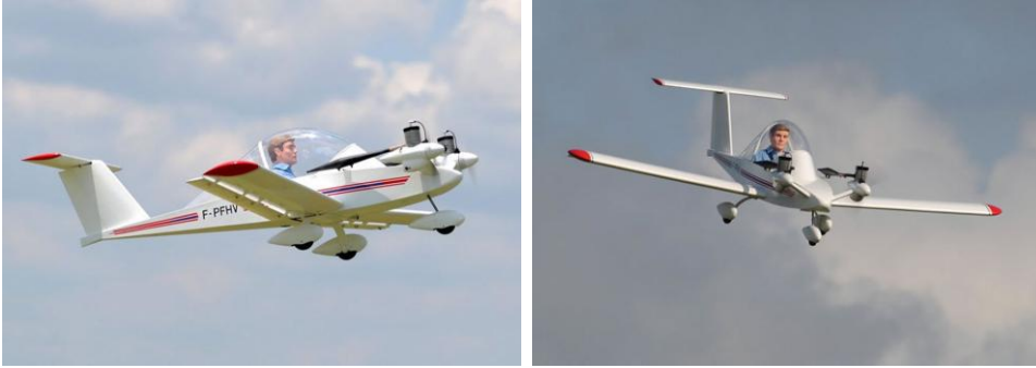
Dean Copeland's Cri Cri flying through the skies of Lakeland, Florida looks very realistic at 50 percent scale.