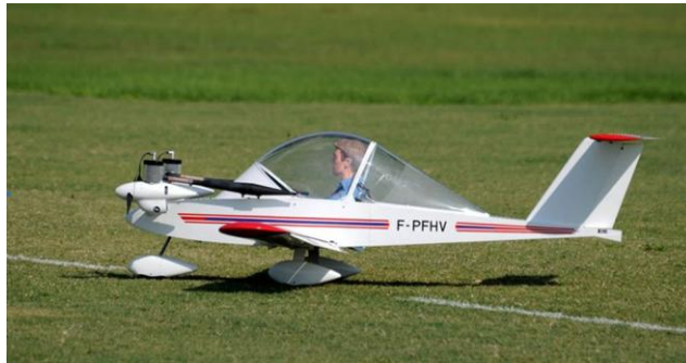
Taxing off the runway at Top Gun 2012 after completing the judged flight.