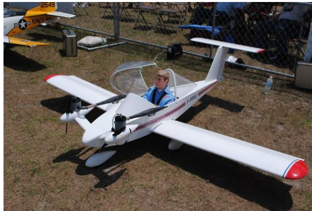
The Cri Cri 's pilot gets a little ventilation while waiting for the next flight slot.