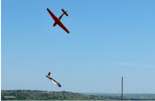
- Warbirds as they are making a turn around the Pole of Doom.