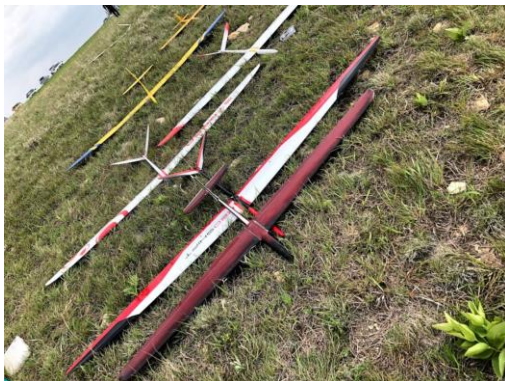
- Parked on grass is an example of the unlimited gliders at the event.