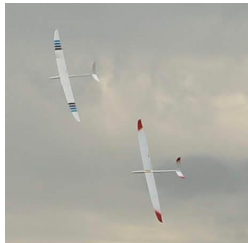
- Two unlimited racers flying a close heat.