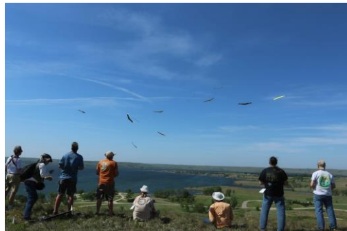
- Pilots shown flying off the south end of "Airport Hill" at Wilson Lake KS. Pilots will fly combat for hours until the event organizer sees participation is down and calls an end to the event. Each pilot keeps a score card which gets signed by the person he knocks down.