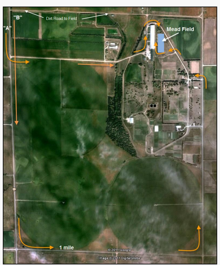
Mead Field (South View)