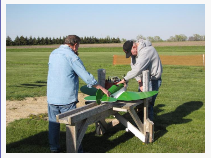
Website: <a href="http://www.weflyrc.org/">http://www.weflyrc.org/</a>