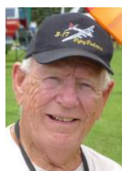
new “Double Diamond Demon”.