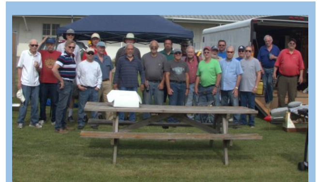
FLYERS AT SPRING 2019 FUN FLY MEAD FIELD

https://www.wunderground.com/personal-weather-station/dashboard?ID=KNEMEAD2