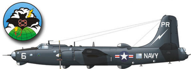
Martin P4M-1Q Mercator, Fleet Air Reconnaissance Squadron One MCAS Iwakuni, Japan, 1957

Location: Papio-Missouri River NRD Office 154 th and Giles Road