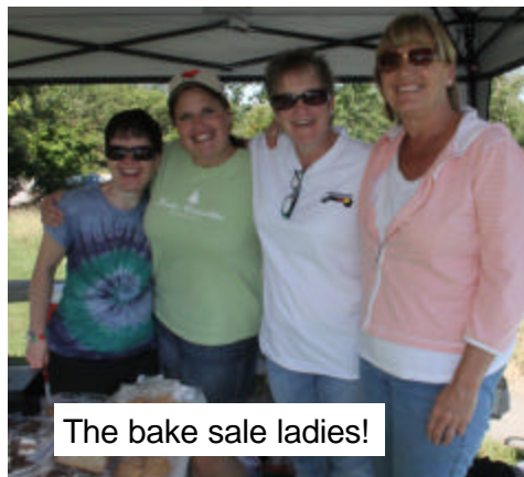
The bake sale ladies!