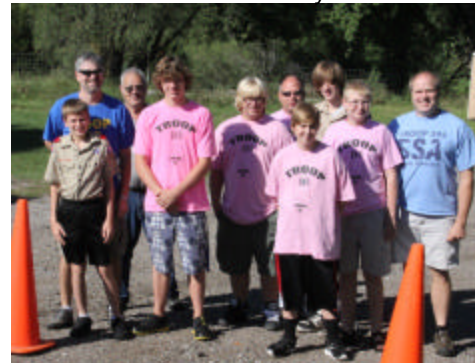
Scout troop 395 handled the parking