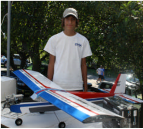
The day's big winner