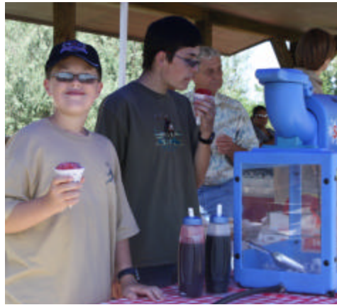
The first sno-cone is always the best!