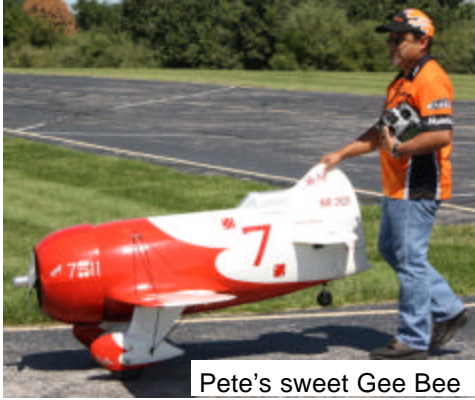
Pete's sweet Gee Bee

Lots of volunteers made this show a success