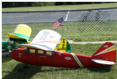
Old timers flew on Labor Day, too.