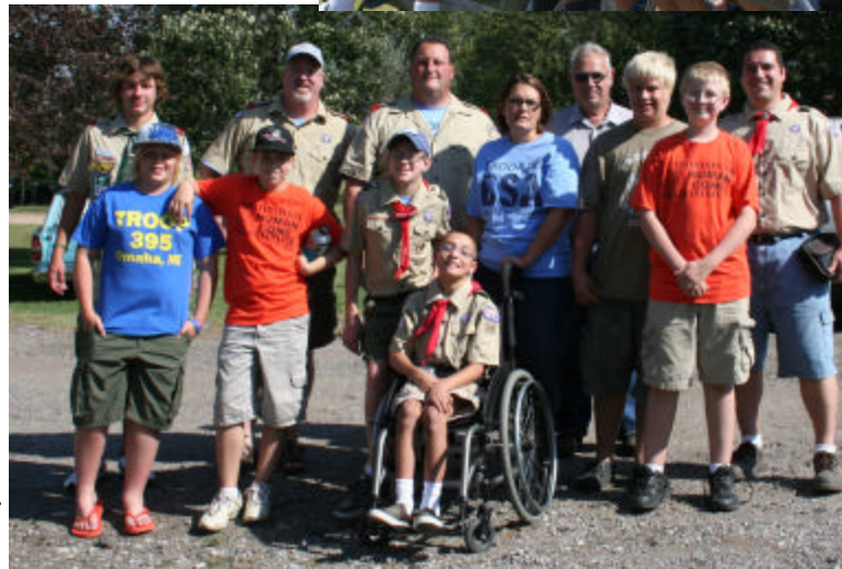
Boy Scouts from Troop 395 helped throughout the day