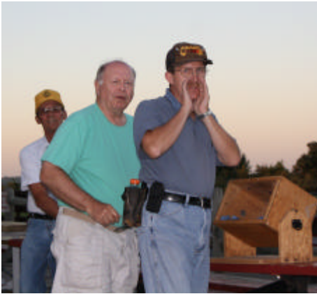
Who's got this number???