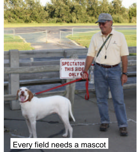
Every field needs a mascot