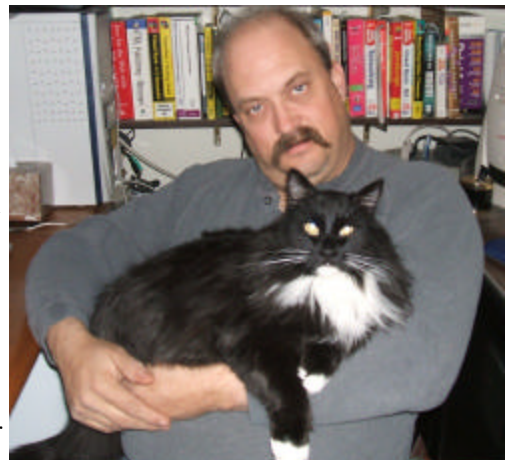
Even my cat managed to distract me.