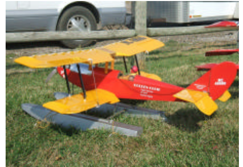
Where's the lake?