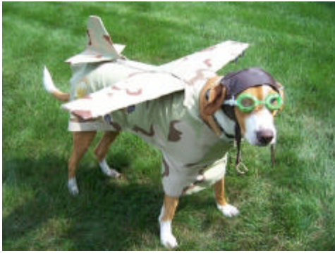
(sorry, I couldn't resist this one - ed)