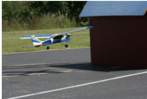
...and here comes the plane...