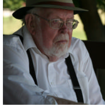
Olie's grumpy cuz he enjoys it →