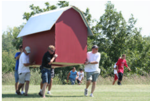
Here comes the barn...

? A preliminary slate of candidates for board positions is being created. Contact Steve Culver if you are interested in running for a board or office position.