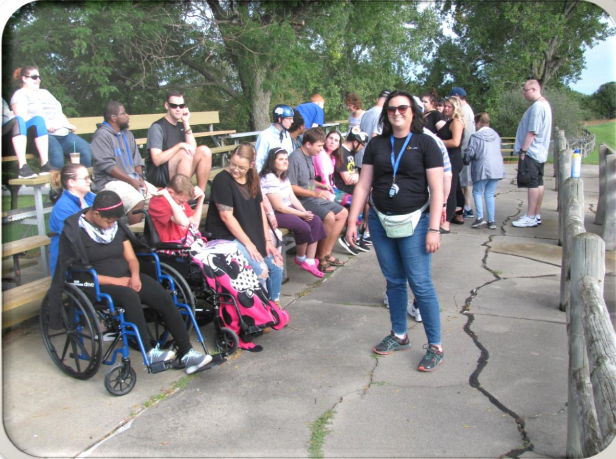
Photos: Special Needs spectators getting seated