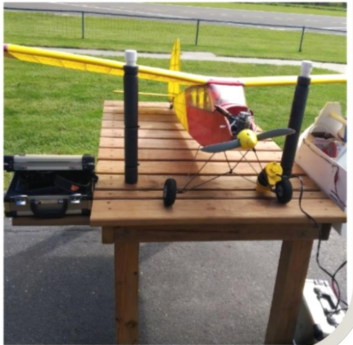
Some additional photos of Old Timers and their aircraft