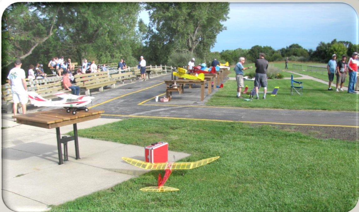
Photos: Pilots in action providing a great show and some hands-on action as well