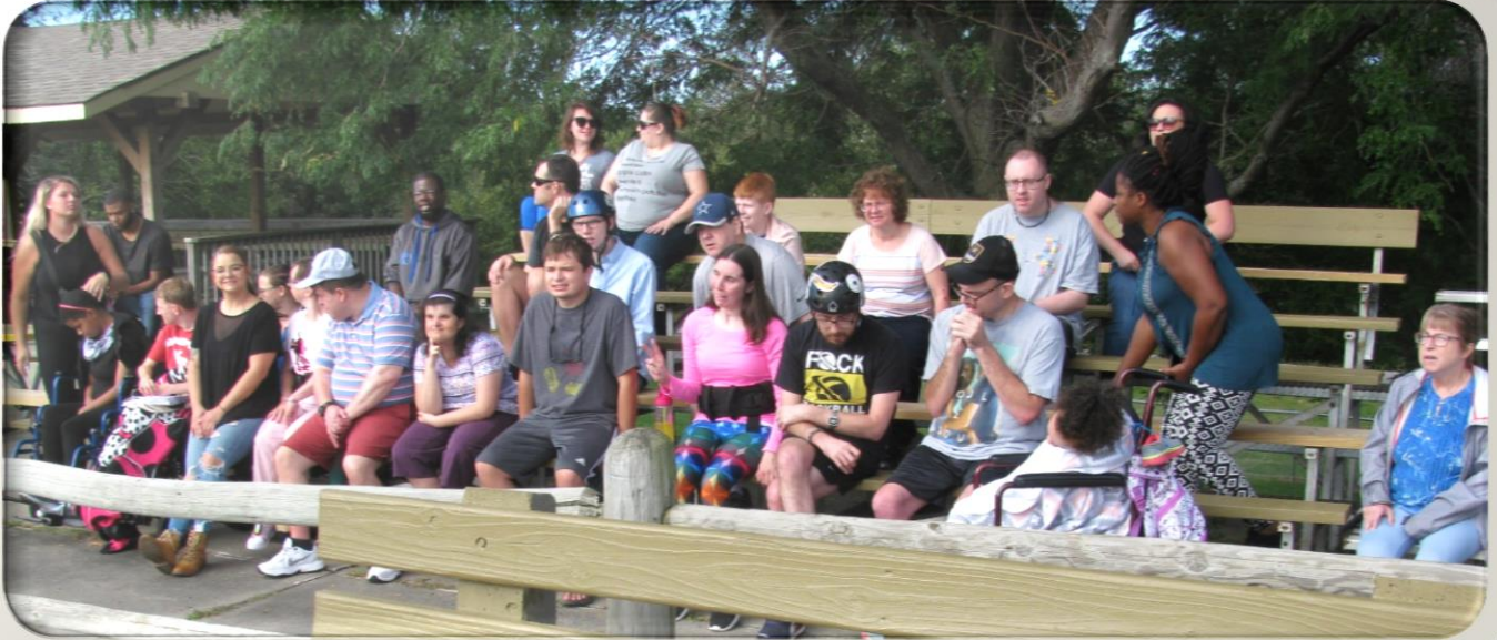
Photos: Special Needs spectators waiting for the action to begin!