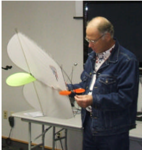
Where's the rudder servo?