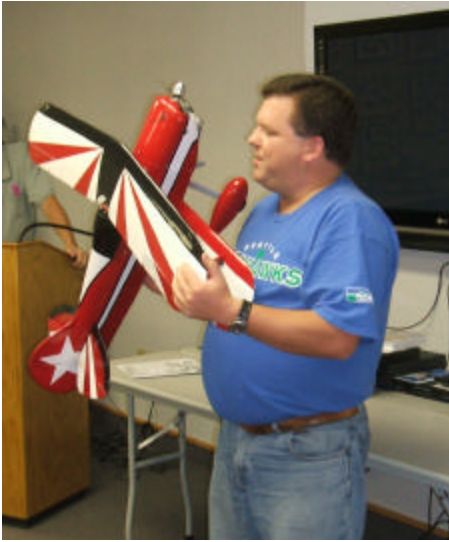
Big Ed show off somebody else's work