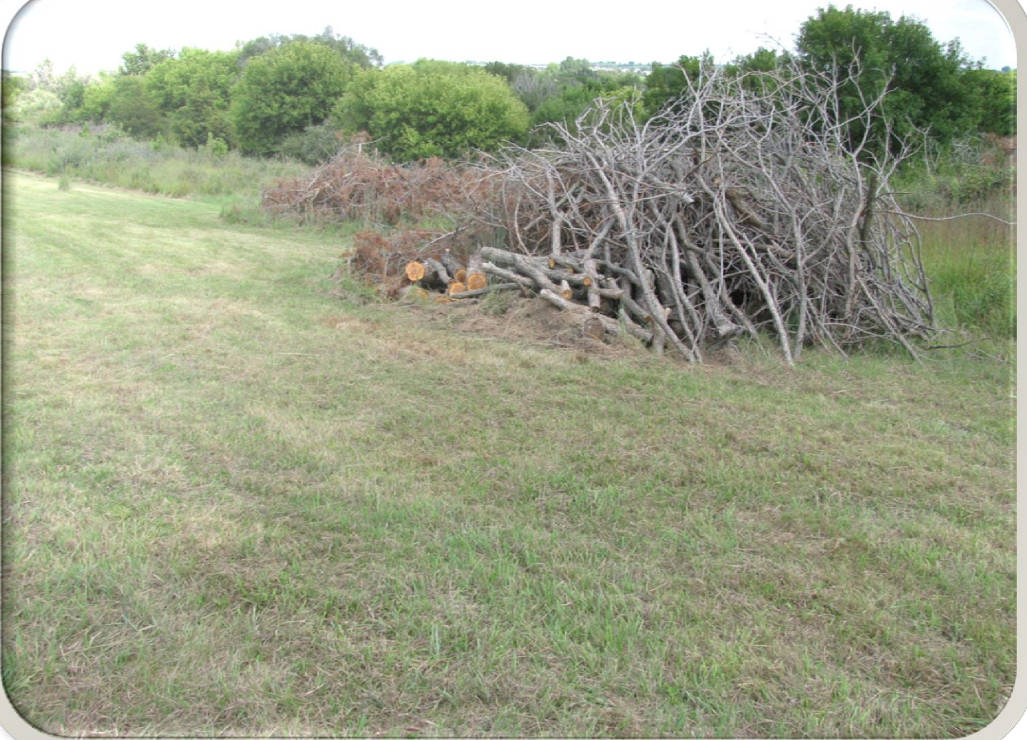
Sept 2017 One pile for city removal