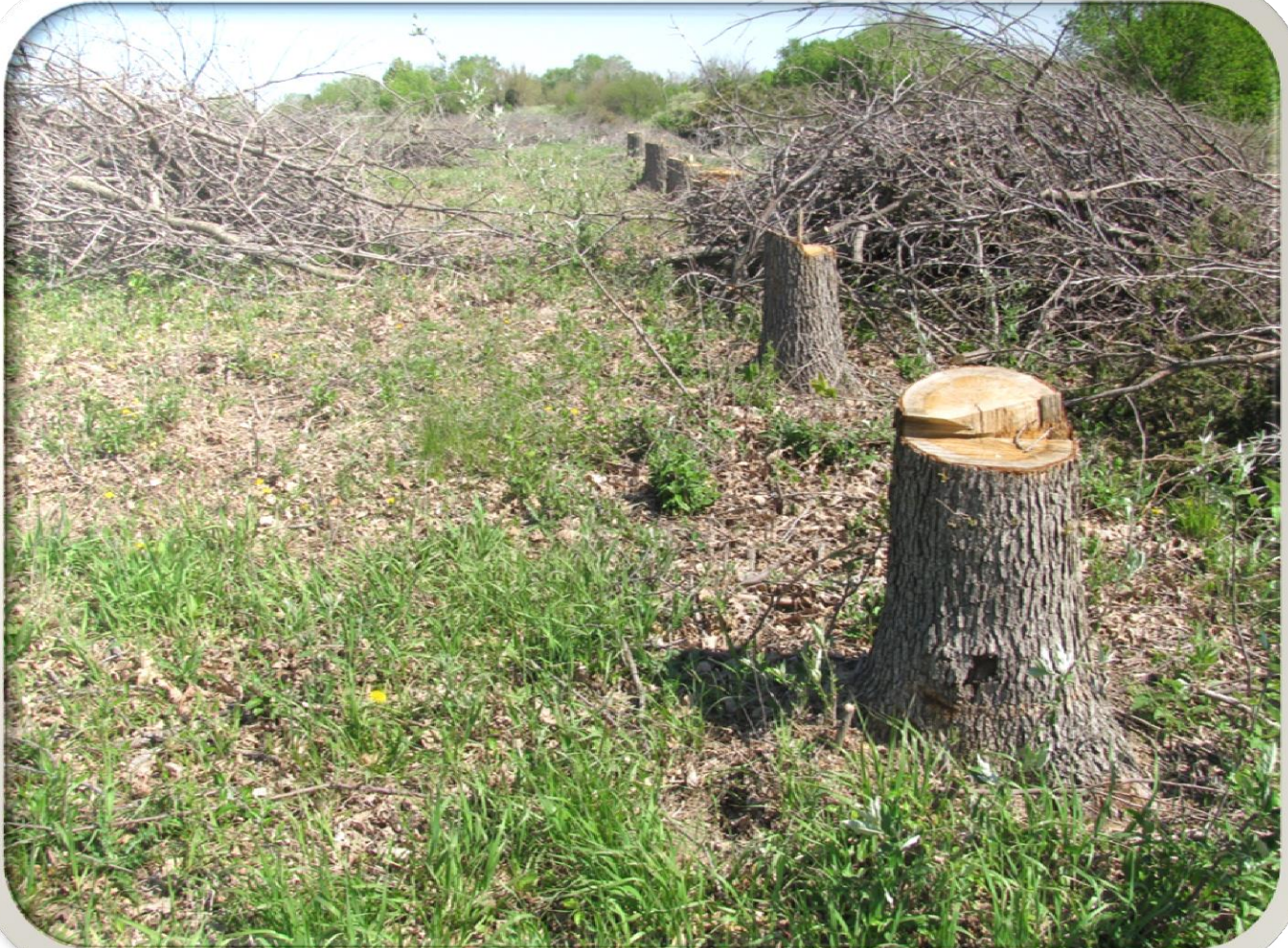
Row of trees planted in 1986-7 became a problem (2017 photo)

1991 May – Three volunteers cut down some unwanted growth east of runway (**morning flyers). The Saturday after the next club meeting about 25 volunteers helped drag the cuttings & piled the brush for city removal.