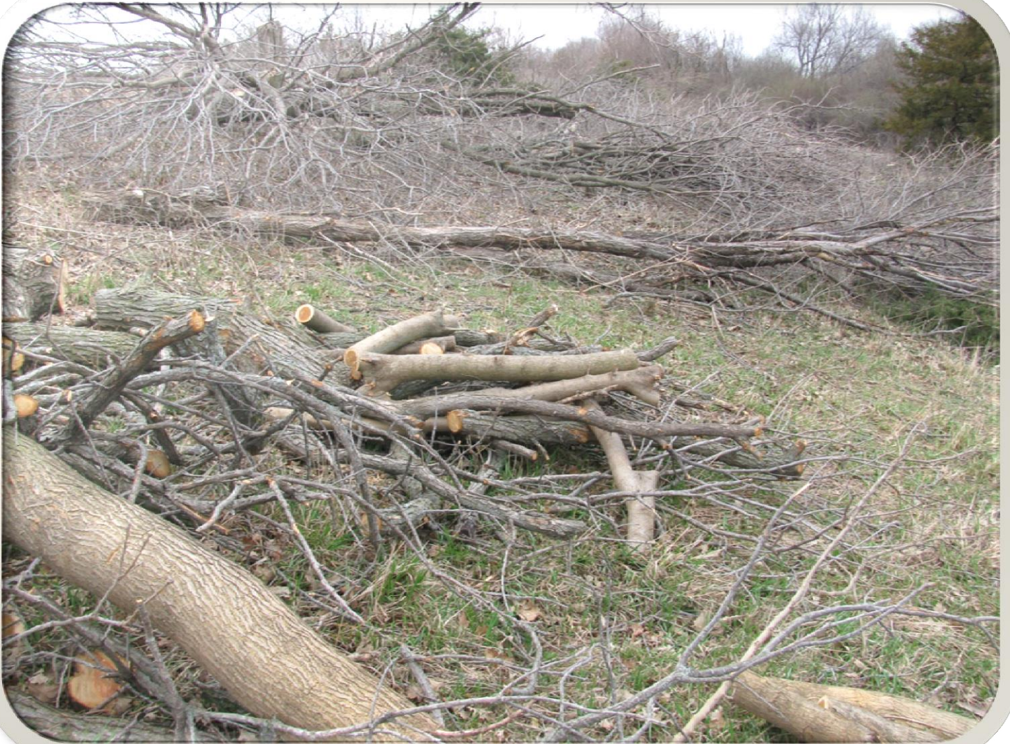
May 2017 Downed trees ready for dragging