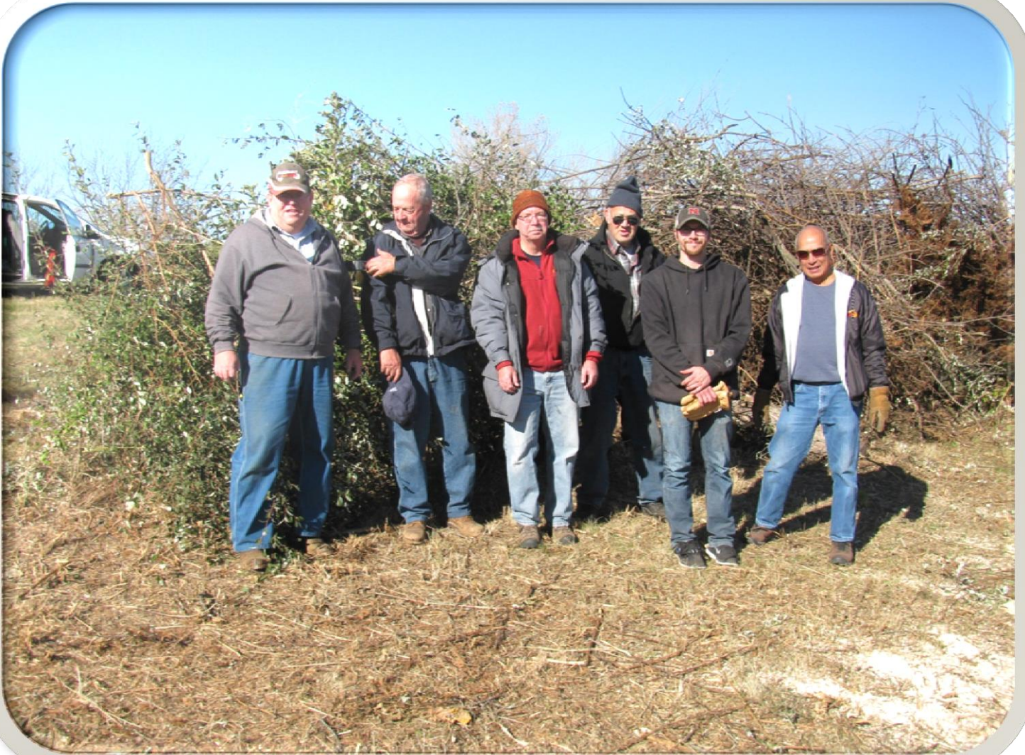
Oct 2017 One crew taking a break

Remainder of 2017 - volunteers cut, limb, drag, cut stumps & piled for city removal... All told there were about 50 volunteers involved in the 2017 effort to remove an estimated 100 deciduous and evergreen trees, etc .