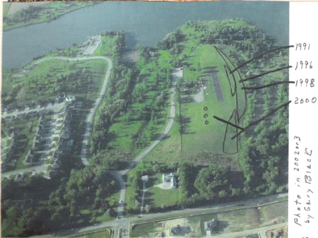
Summary of four 1991- 2000 vegetation removals