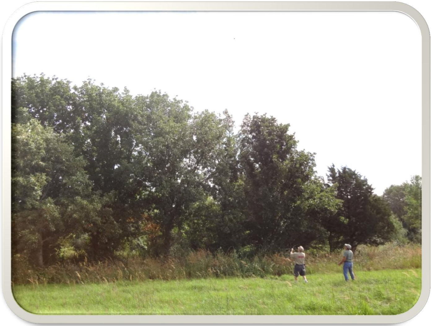
Sept 2016 Where is plane?

2017 March 18 - About 35 volunteers cut down trees, limbed, etc (President Casey Vohnout, Vice Pres Rick Sessions, Arborist Mike Donham). An observation: A rare sound was heard around 11:30 am this day from the top of the runway, when the writer was going to get pizza. It was the sound of about 12-14 working chain saws seeking revenge for all the problems & damage caused by these unwanted growing trees, bushes, etc. See photos 4, 5, 6, and 7.