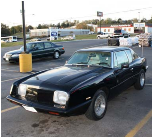
OK, it's not a plane, but I saw this really sweet old Studebaker Avanti on the way to the meeting and I just had to share it.