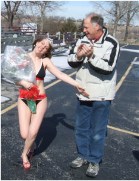
Our 2008 queen.