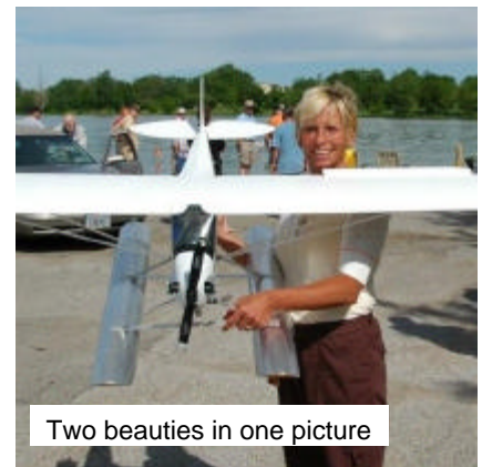
Two beauties in one picture