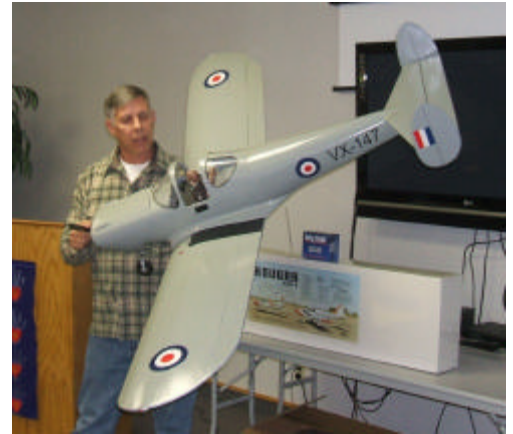
Bob's building projects are always impressive!