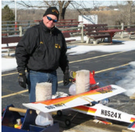
Skip's ready to go...