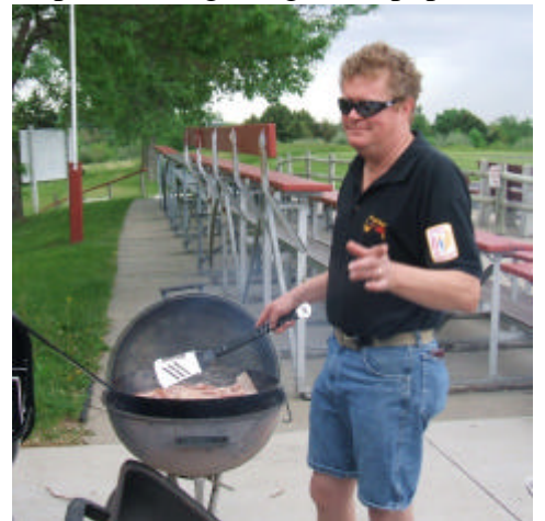
Skip's cooking didn't kill anyone.