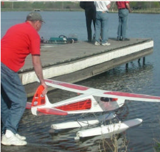
The float flies were as popular as ever!