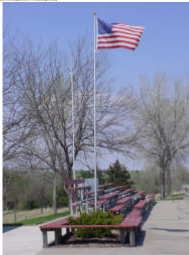
A new flag flies at Hawk Field