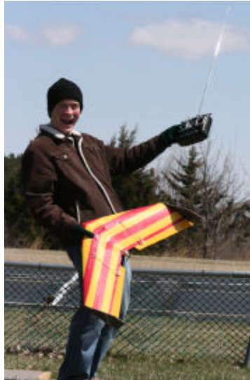
Can you believe this punk graduated high school?