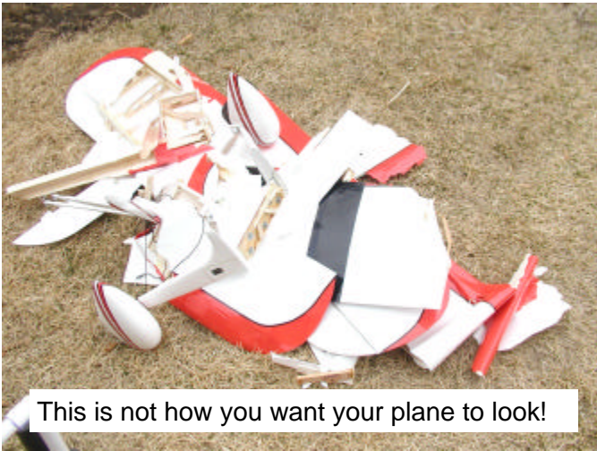
This is not how you want your plane to look!