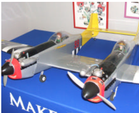
Ralph's new twin is cool!