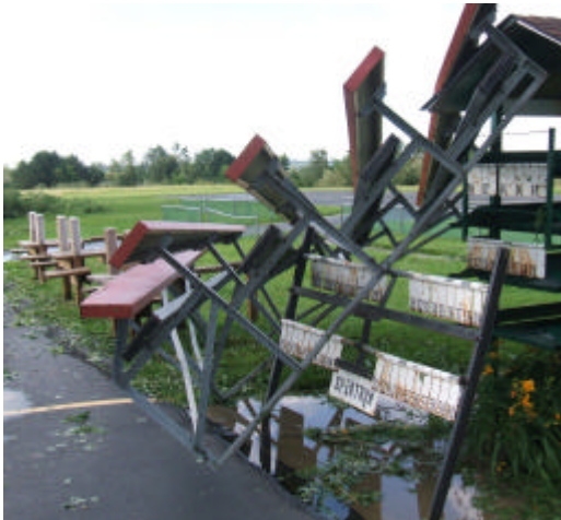
Mother Nature laid a lick on Hawk Field