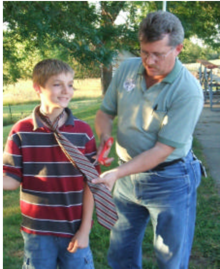
Lots of new pilots soloed this year!