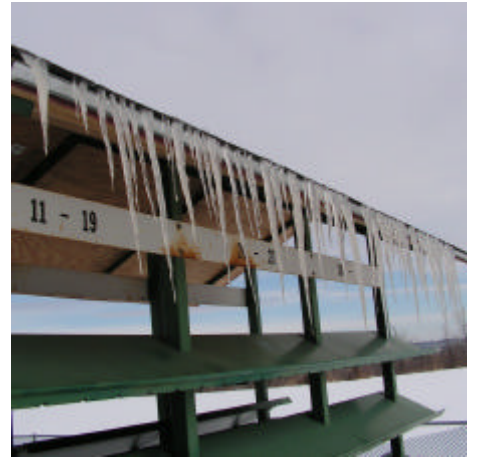
Yeah, it was a cold winter!