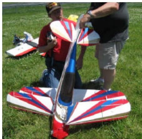
What can I say but, "Ouch!"