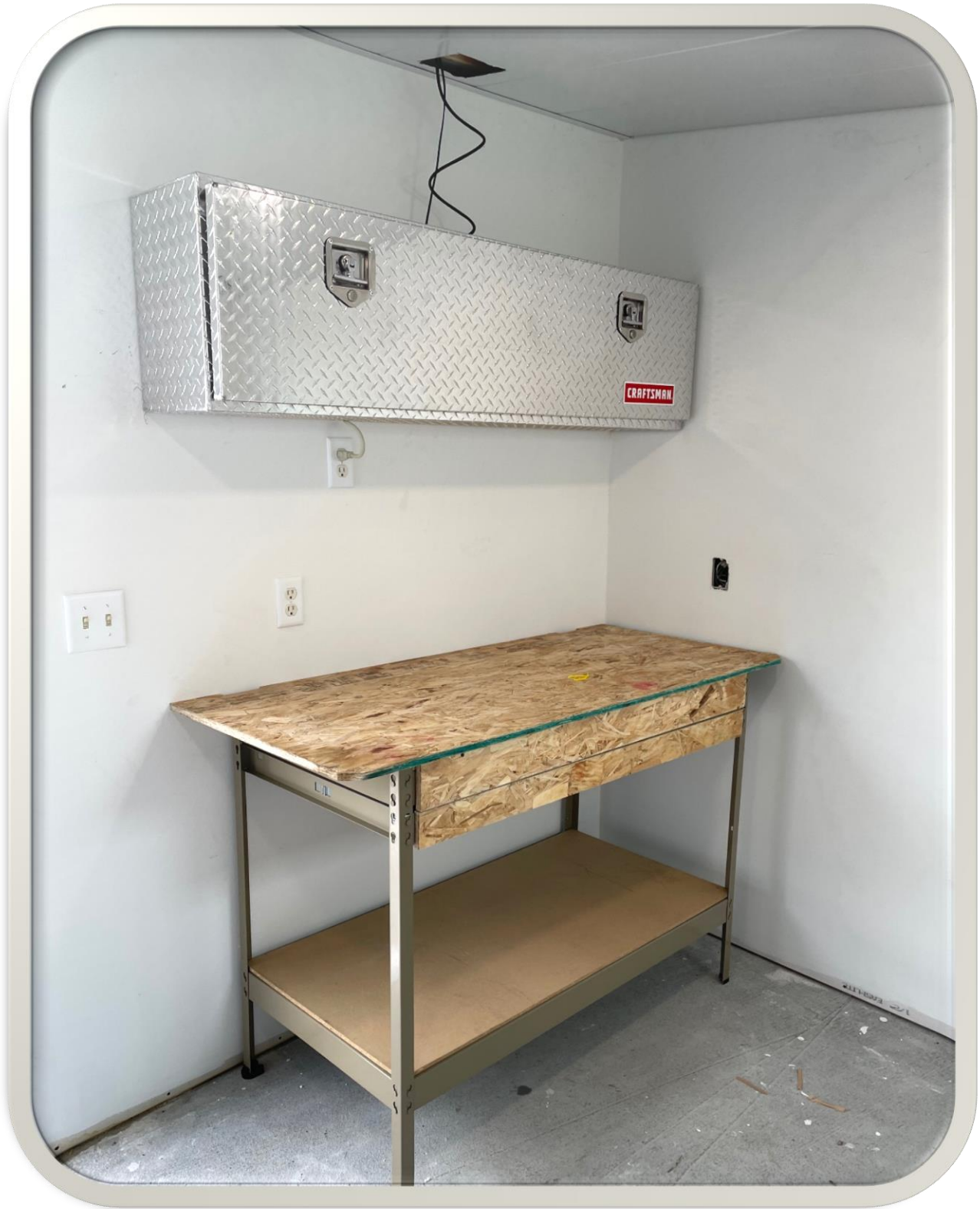
Shed Interior Lights, wire and walls ready for use!