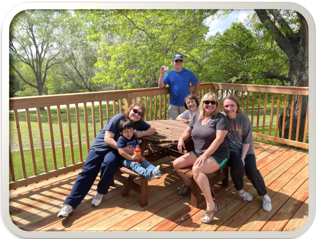
Dennis Bender Memorial Picnic table that seats 4 to 6 people (or more)