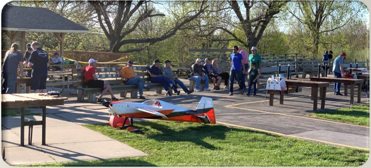
Training Nights (Thursday 6 PM to 8 PM) are very popular