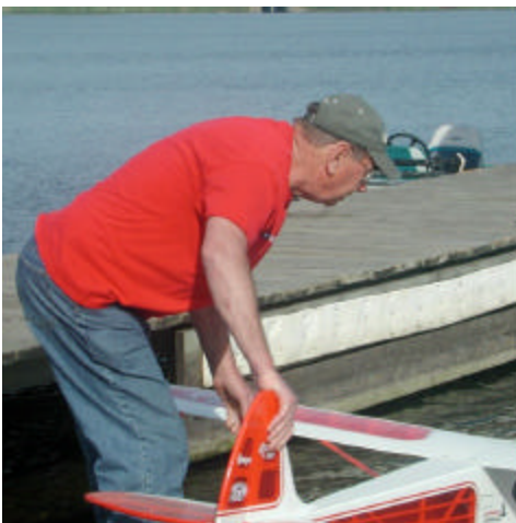
Float Fly pictures courtesy of Olie Olson