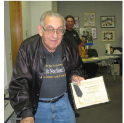
Doc soloed a long time ago!