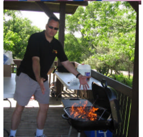
Memorial Day is coming, too!