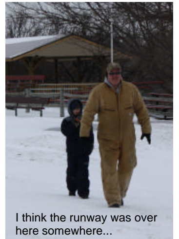
I think the runway was over here somewhere...

* * * * * * * * * * * * * * * * * * * * * * * * * * * * * * * * * * * * * * * * * * * * * * * * * * * * * * * * * * * * I HATE WINTER!