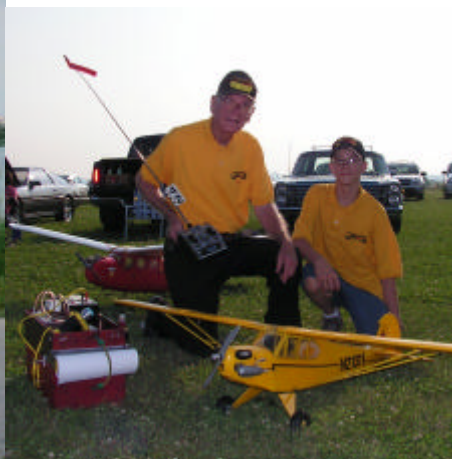
Can you believe that little kid is now in college?