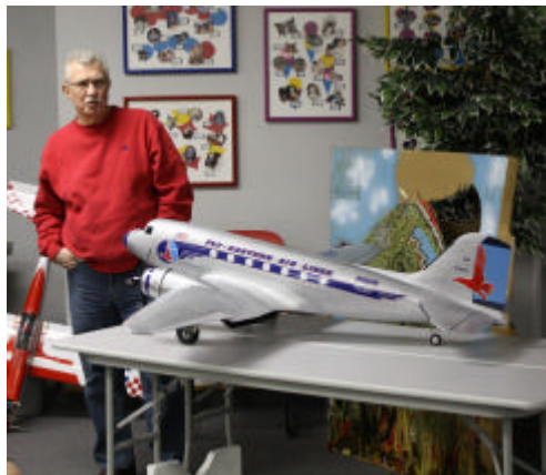
A long-term project completed.