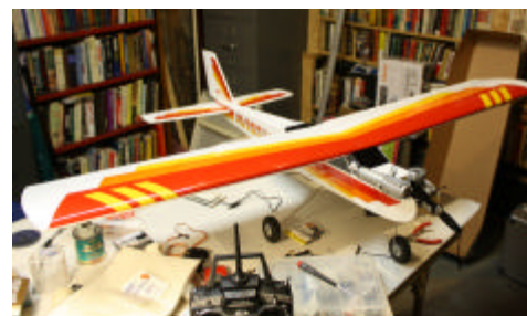
My new Avistar, ready to go!