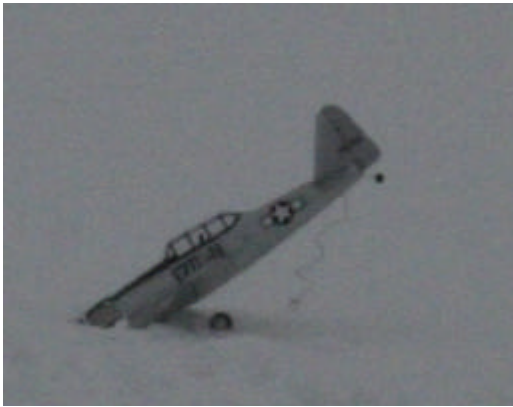
Snow + Plane = Bad