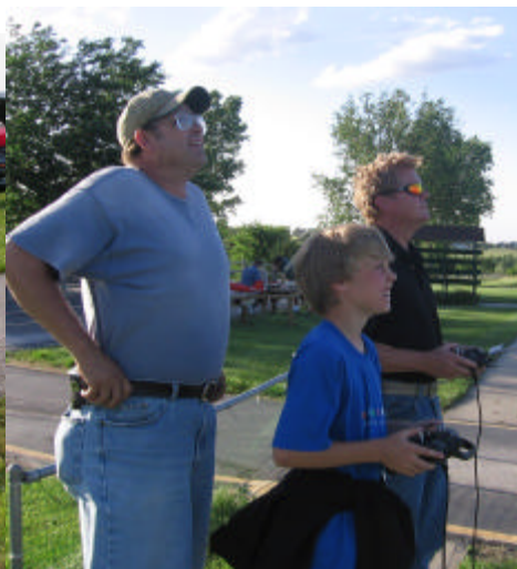
Flight training starts on April 1