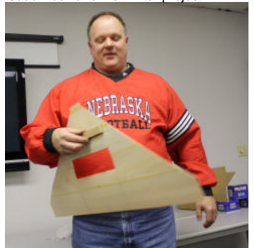
The start of an SR-71