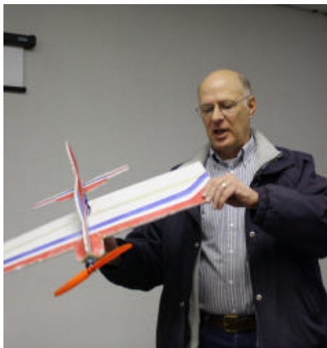
My foamy is tougher than your foamy!