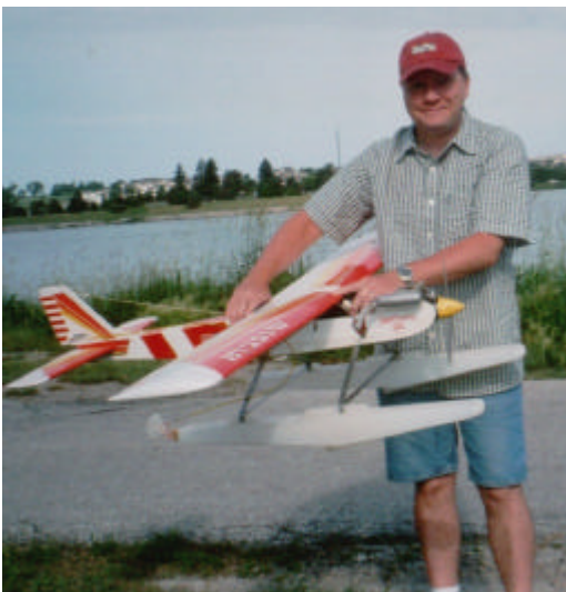
First Float Fly - May 5th, 8:30 am