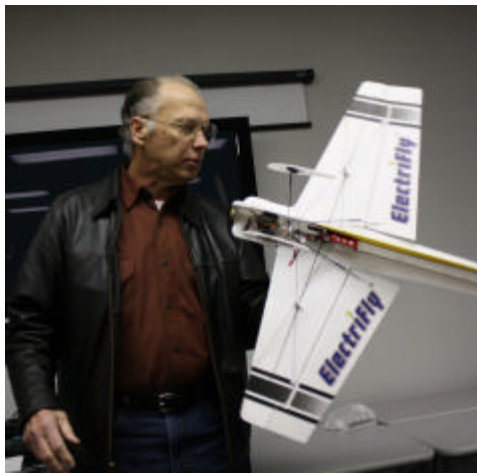
Steve shocked the crowd by showing something that might actually fly!