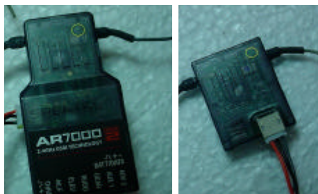
The yellow circle on the main receiver and the satellite receiver shows the location of the led.

I used a small finger tip drill, to be as accurate as possible. And, to keep from running into the led, on