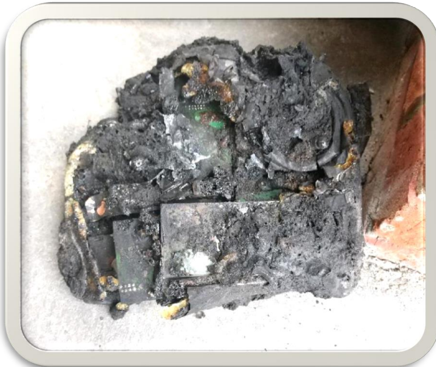
My DX6 Spektrum Transmitter