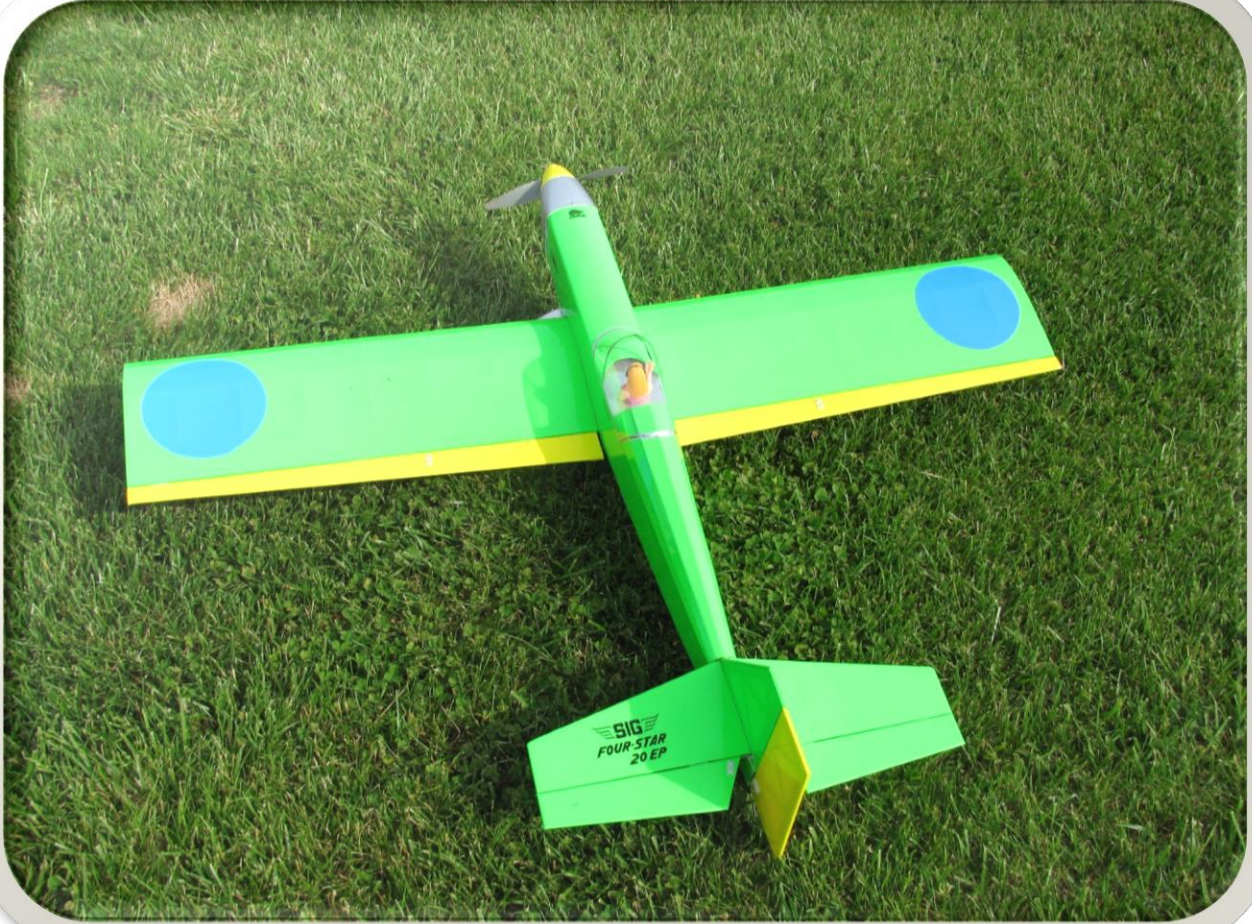
This is the 4 Star 20 owned by Loren B