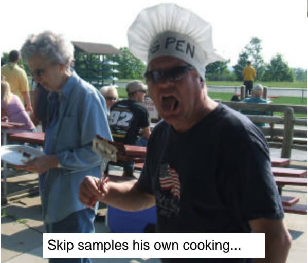
Skip samples his own cooking...