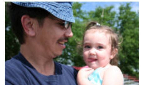
She might be a bit too young.