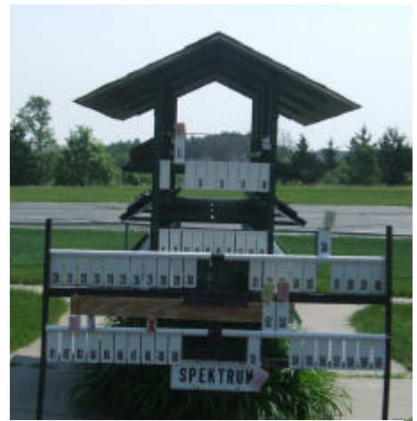
The frequency board is done!

Raffles will not be held during the summer general meetings. The exception would be if a member wishes to donate a plane or other equipment for raffle the proceeds will added to the Make-a- Wish Labor Day Air Show kitty. E.J. introduced discussion for the Labor Day Show which is fast approaching.